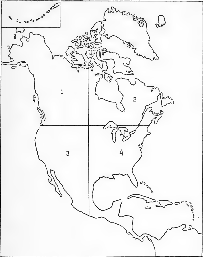
MAP 1.—Outline map of North America showing relative position of the four following maps illustrating the locations of the Indian tribes of North America: Section 1, Northwestern North America (map 2, facing p. 26); section 2, Northeastern North America (map 3, facing p. 106); section 3, Southwestern North America (map 4, facing p. 186); section 4, Southeastern North America (map 5, facing p. 298).