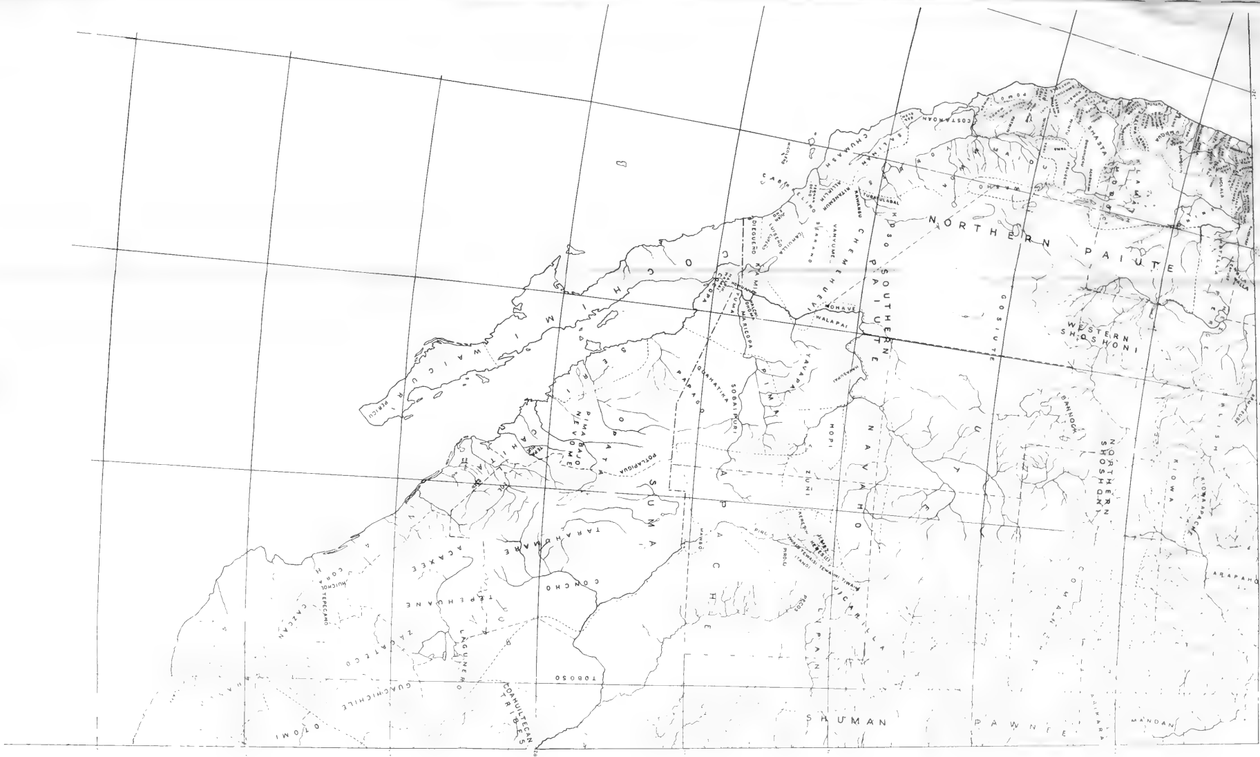
Map 4.—Southwestern North America (section 3 of map 1)