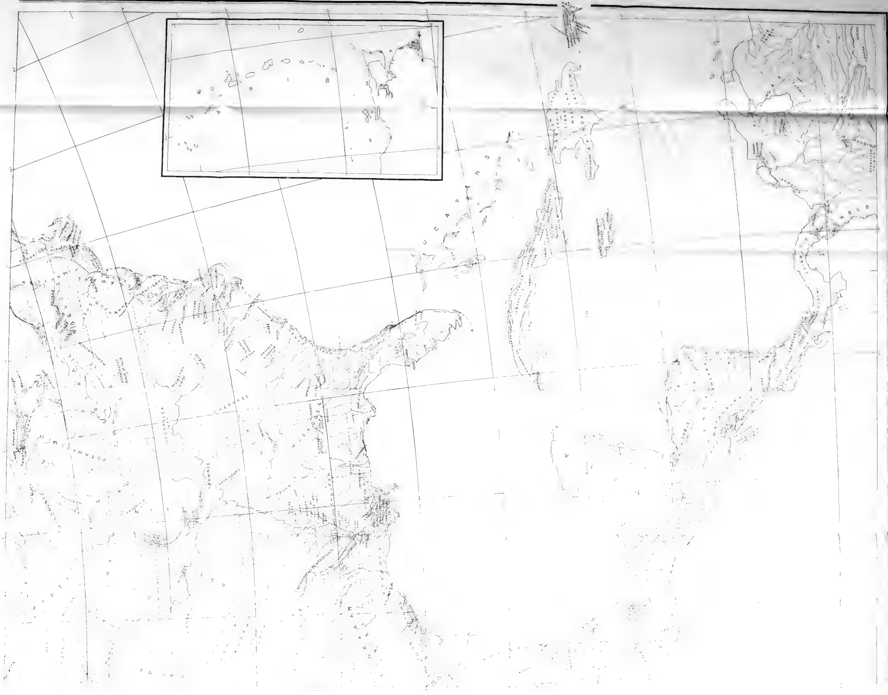
Map 2 - North Atlantic North Atlantic portion of map 1.