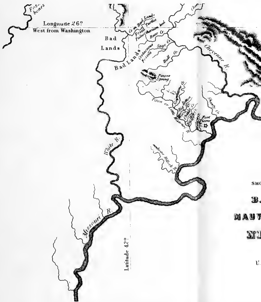
MAP 2.—Map showing the position of the Bad Lands or Mauvaises from a draft by John Evans of the United States Geological Corp