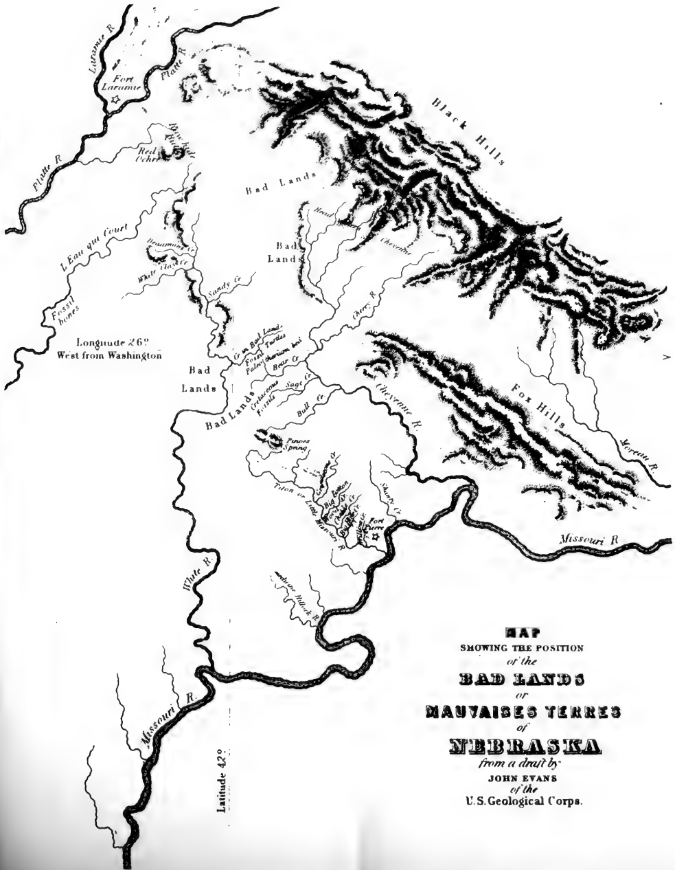
MAP SHOWING THE POSITION of the BAD LANDS or MAUVAISES TERRES of NEBRASKA from a draft by JOHN EVANS of the U. S. Geological Corps.