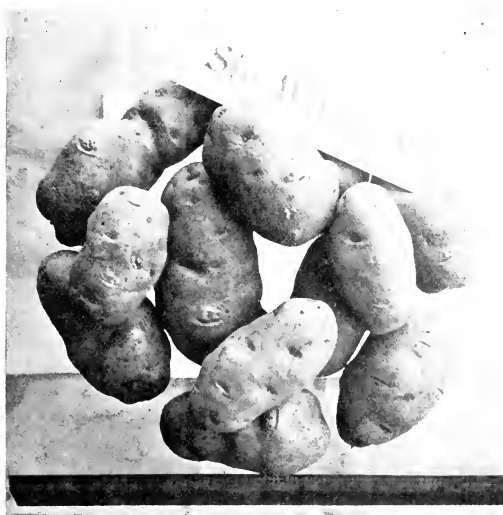
FIG. 2.—Sir William Potato.