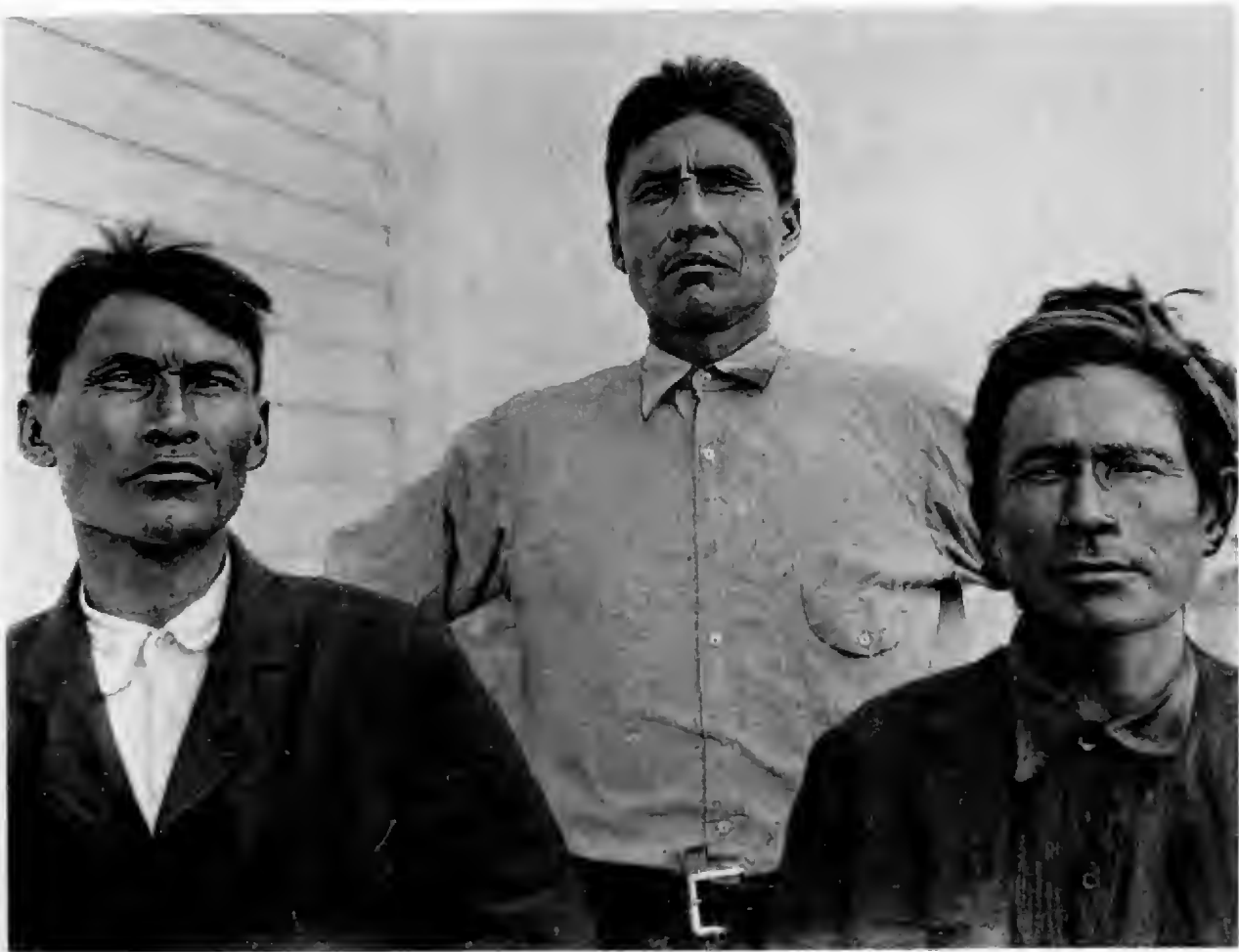
Beaver Indians at St. John