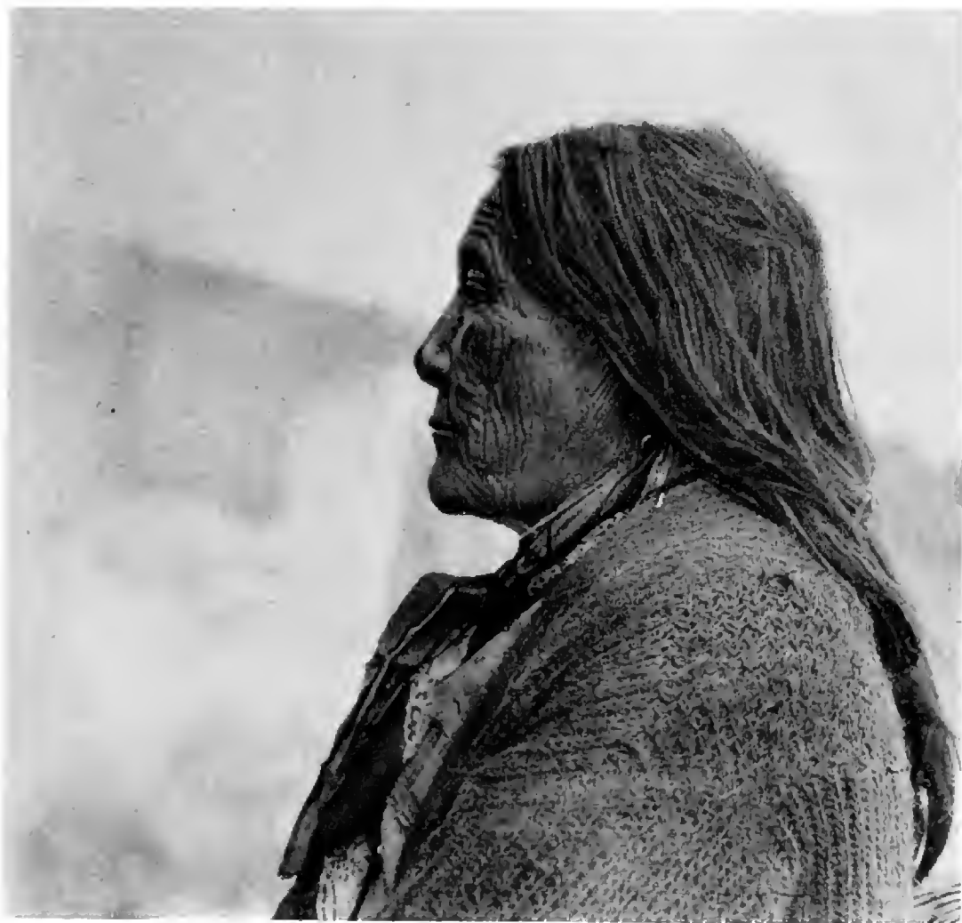
Beaver Indians at Hudson Hope