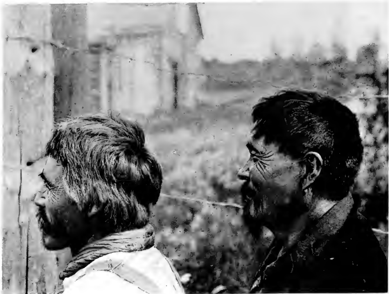
Beaver Indians at Hudson Hope