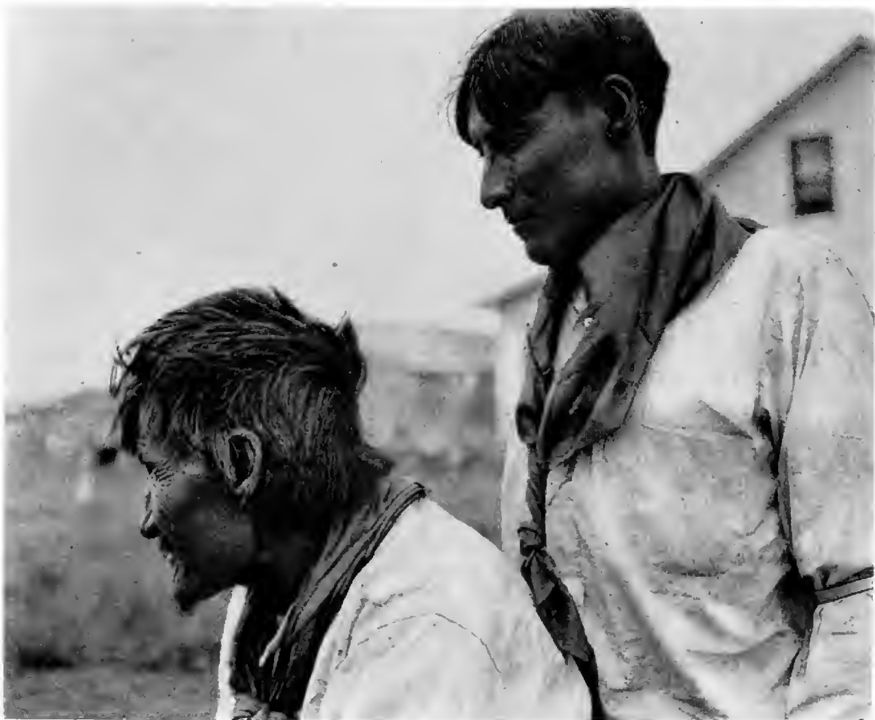
Beaver Indians at St. John