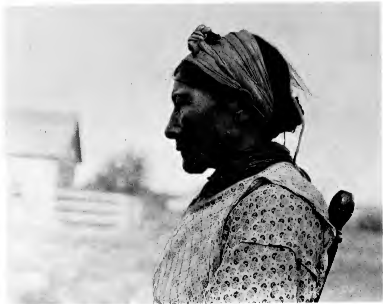
Beaver Indians at Hudson Hope