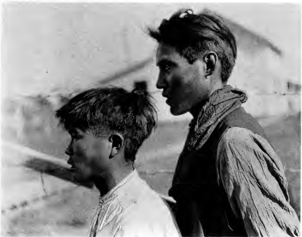
Beaver Indians at St. John