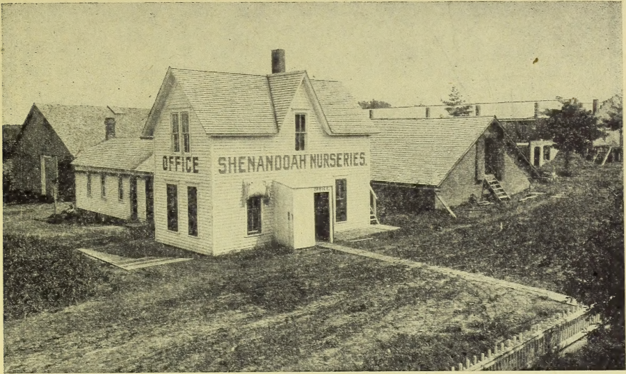
The buildings shown above were constructed between 1885 and 1900. New buildings being added as the need became apparent. The building in the extreme background is still used today as a supplemental storage.