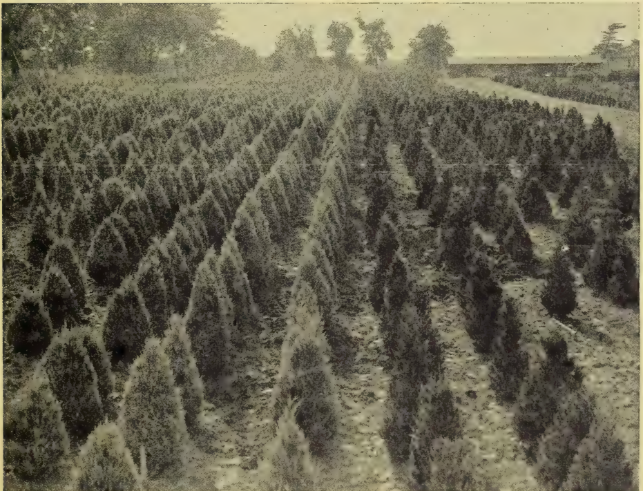
Shown in the above photograph are Virginia Keteleeri (left) and Virginia Cannarti (right). Please note the compact, symmetrical, development of these trees.