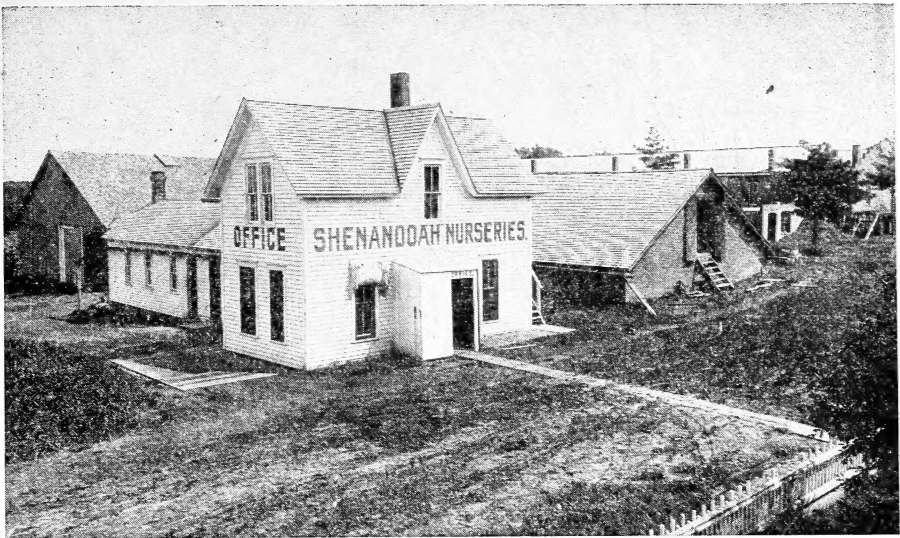
The buildings shown above were constructed between 1885 and 1900. New buildings being added as the need became apparent. The building in the extreme background is still used today as a supplemental storage.