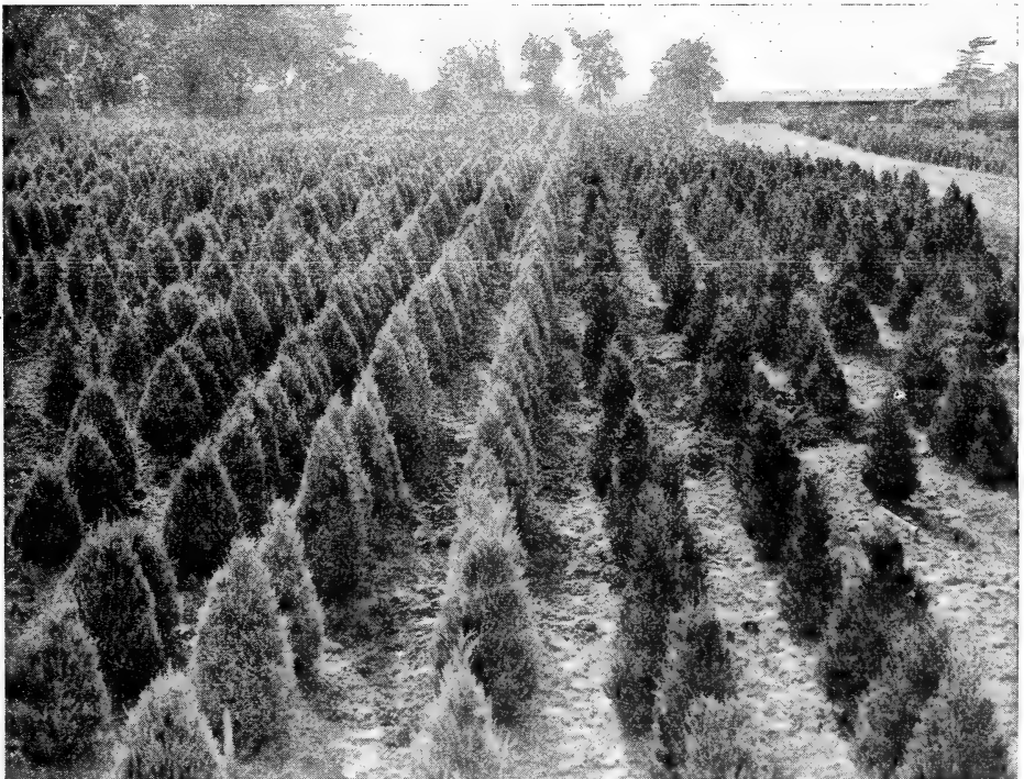
Shown in the above photograph are Virginiana Keteleeri (left) and Virginiana Cannarti (right). Please note the compact, symmetrical, development of these trees.