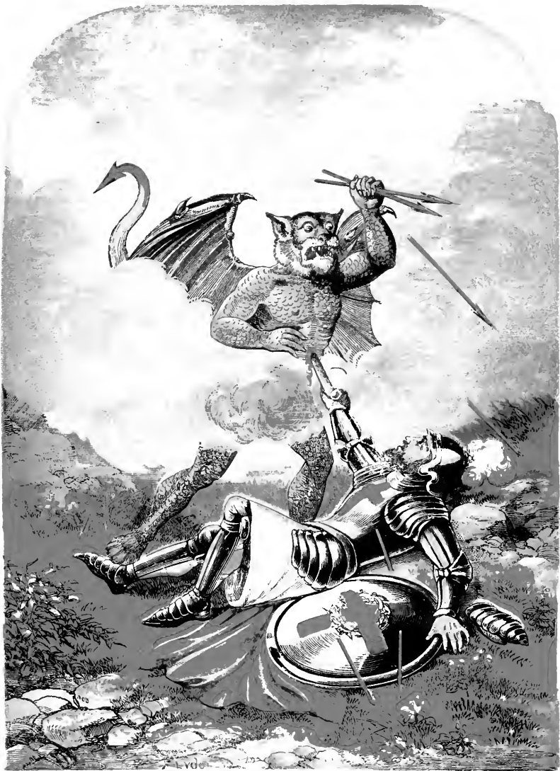
Christian's fight with Apollyon.