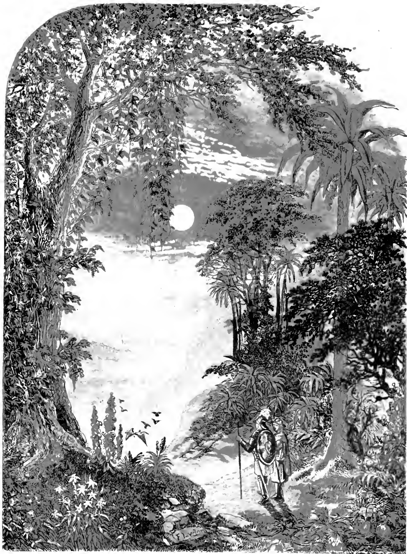
Christian and Hager in the Land of Beulah.