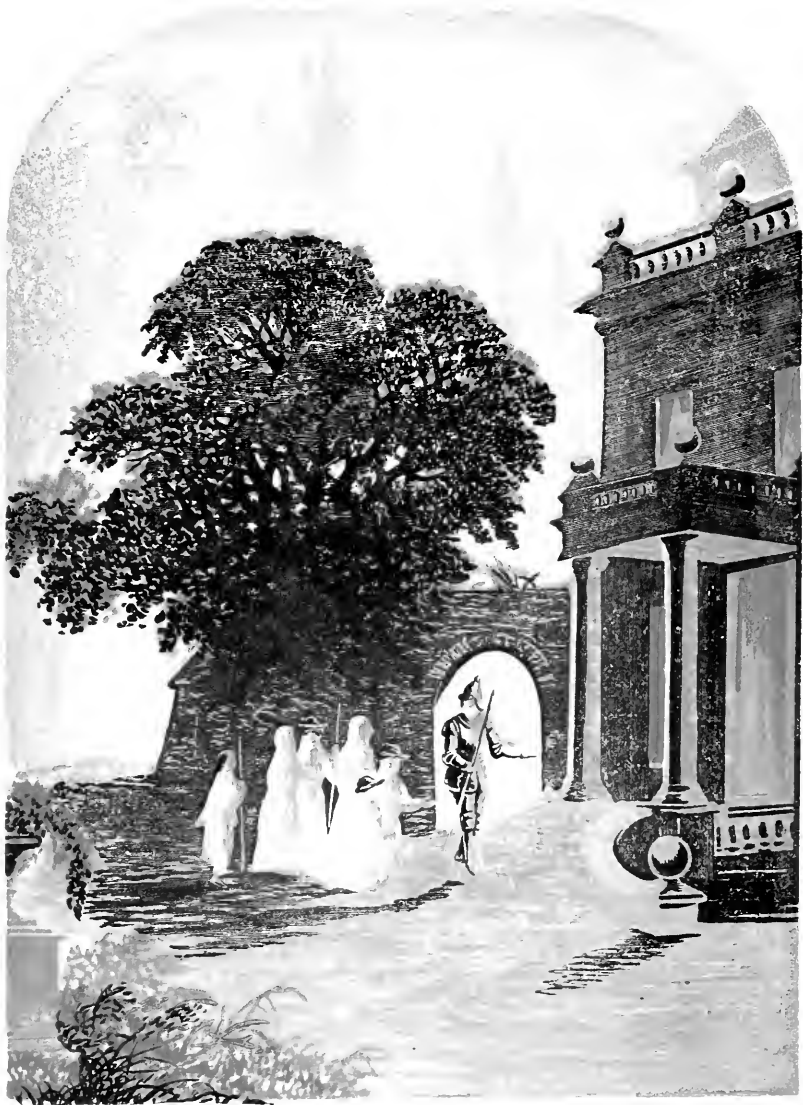
The Priests arriving at the Castle