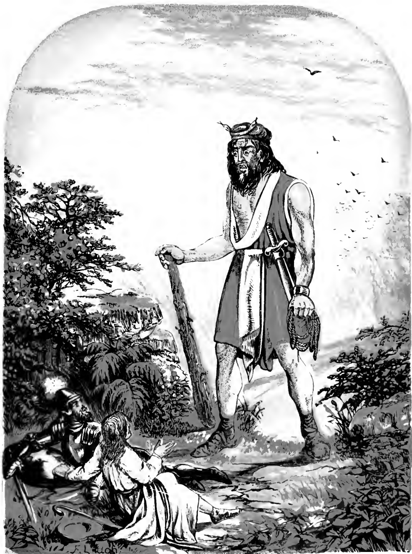
The ... found by Gav' Despar