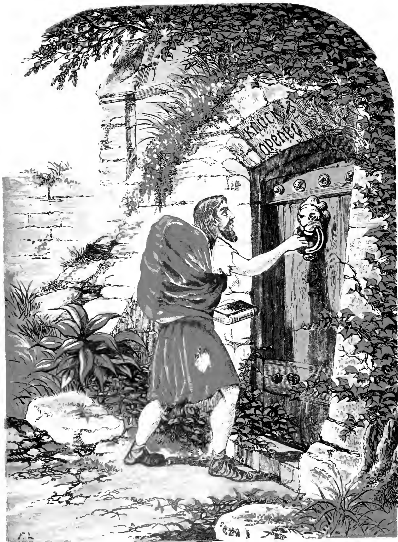
Christian at the Gate.