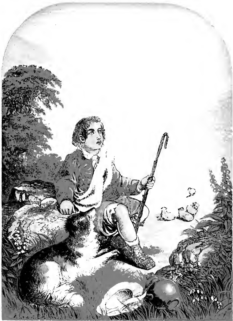
The Shepherd Boy in the Valley of Humiliation.