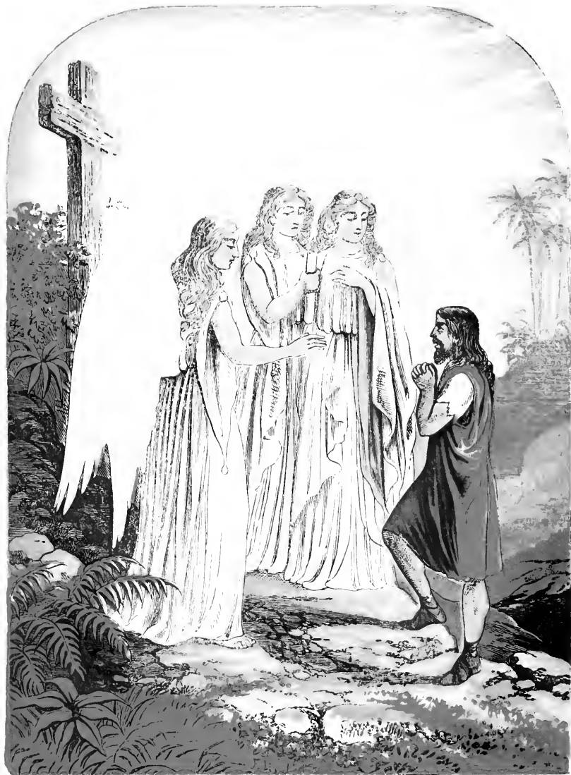
Christian losing his burden.