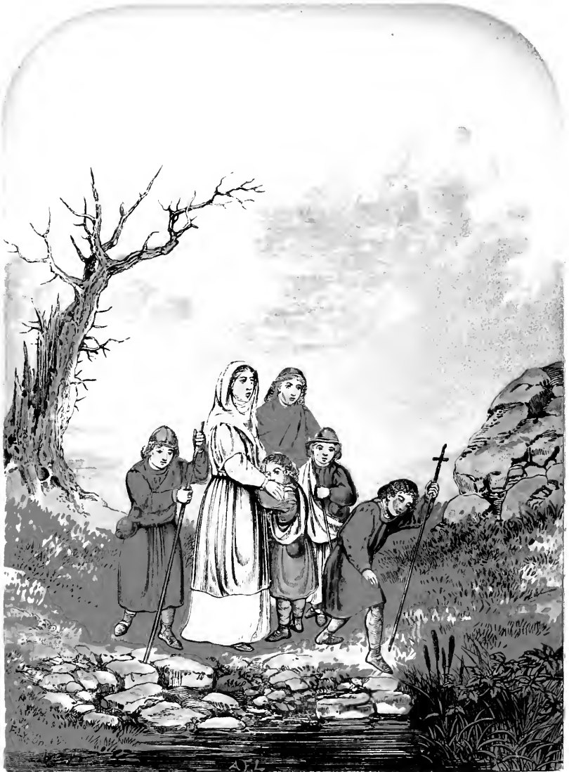
Christiana and her Children arrive at the Slough of Despond.