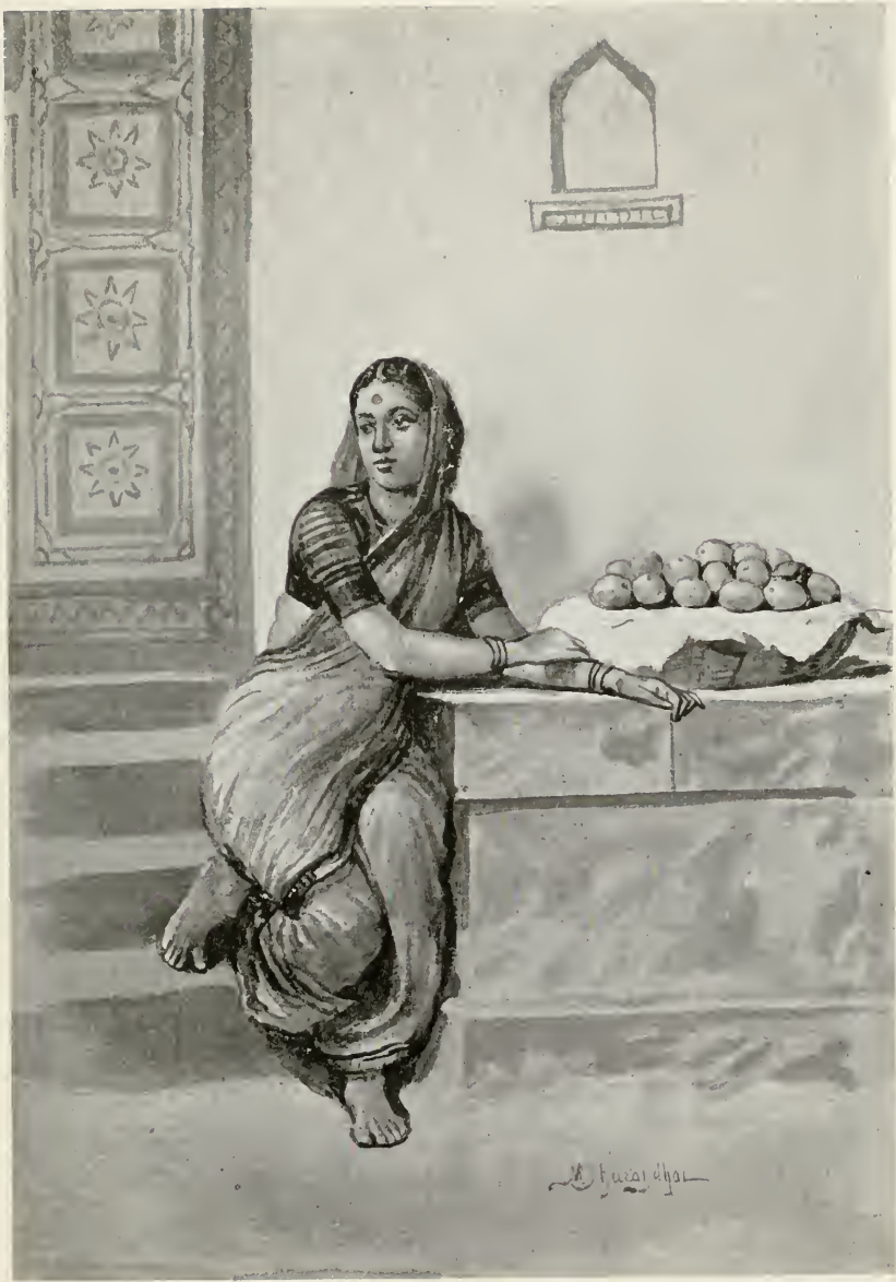
A Deccani Fruit-seller.