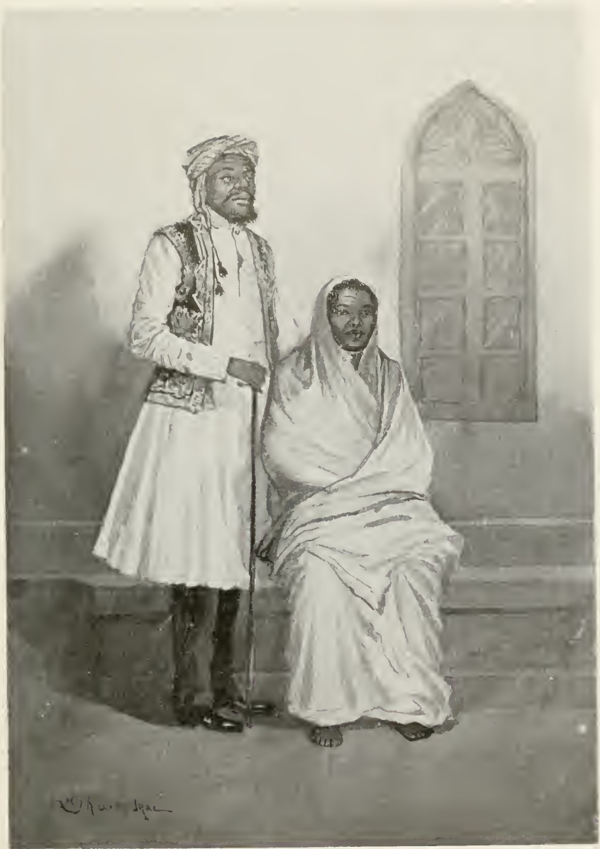
SIDIS OF BOMBAY.