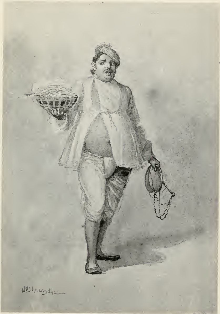
A Marwari selling Batassa.