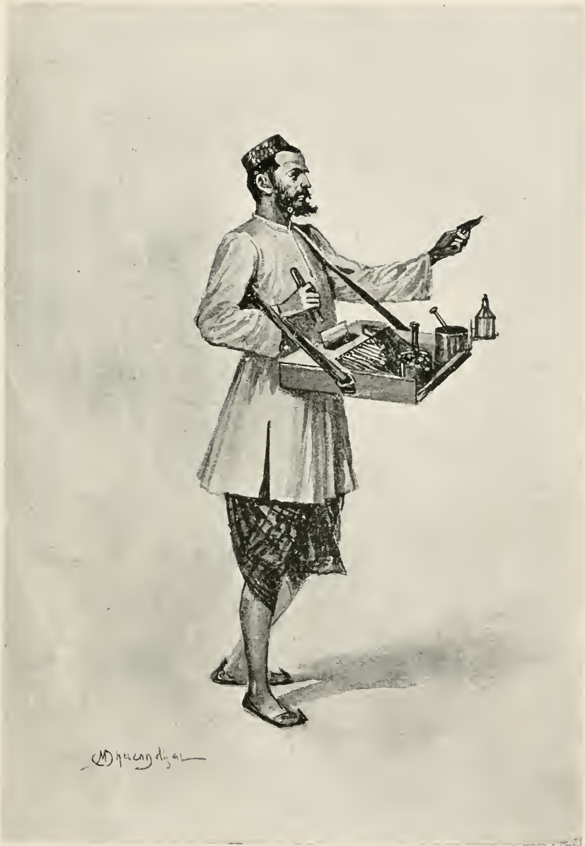
The "Pan" Seller