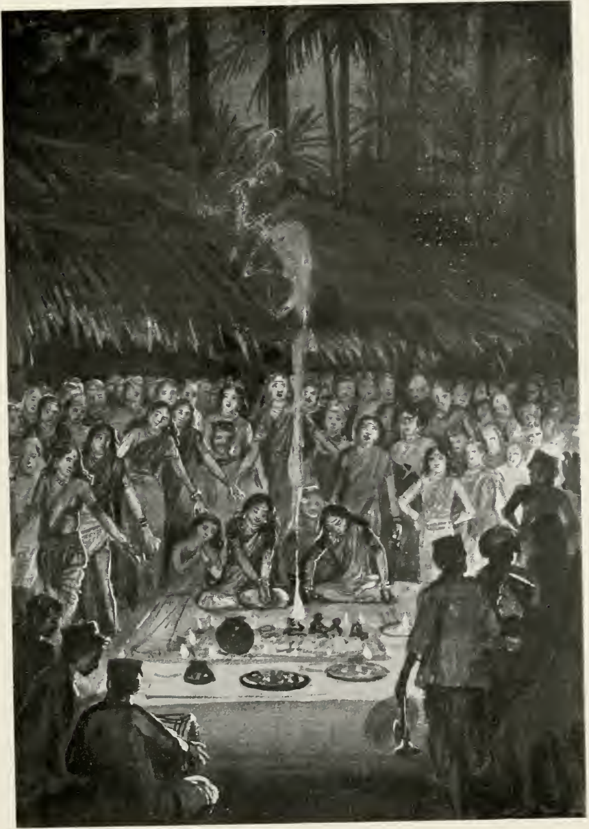
A Bhandari Mystery.