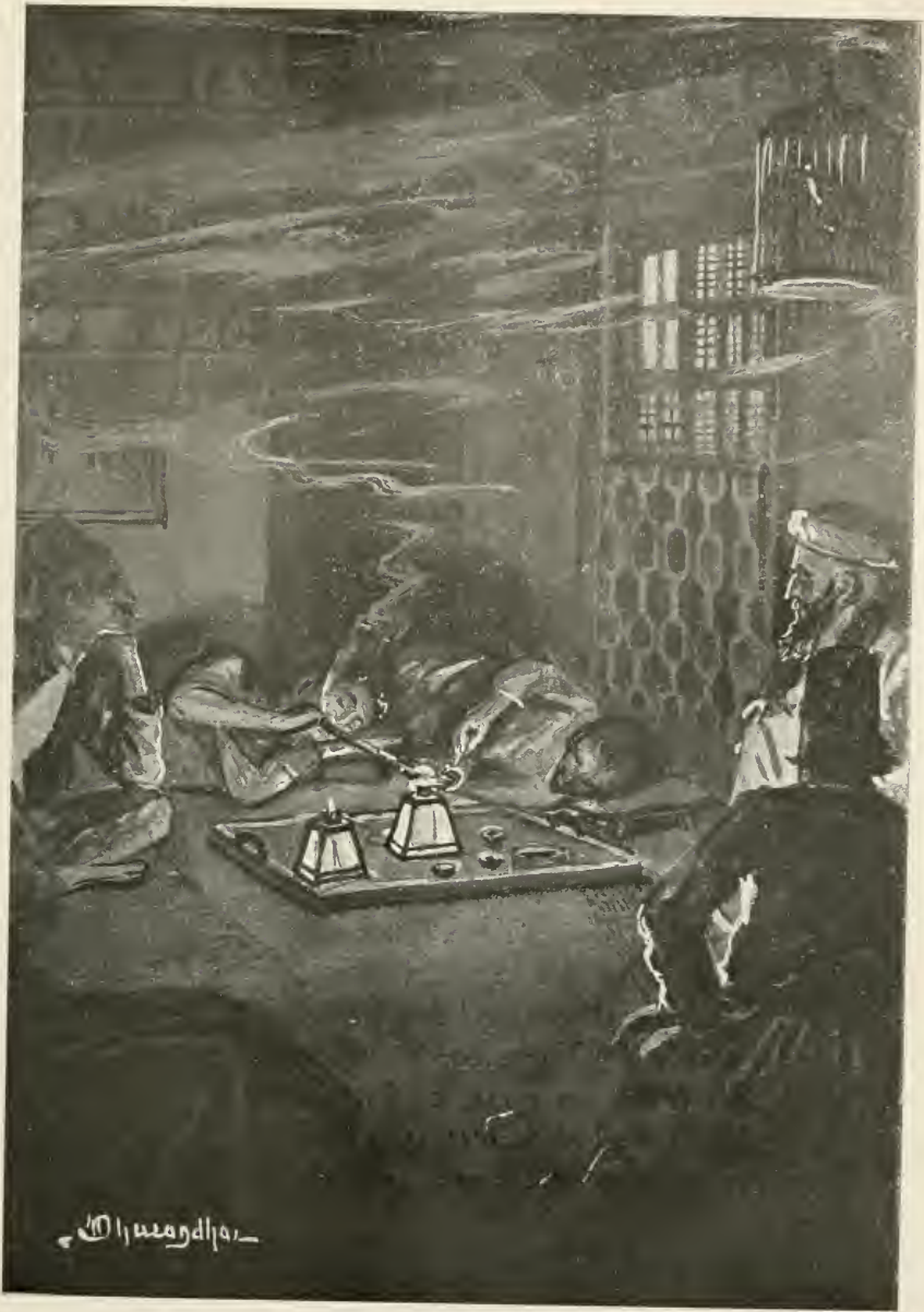
An Opium Club,