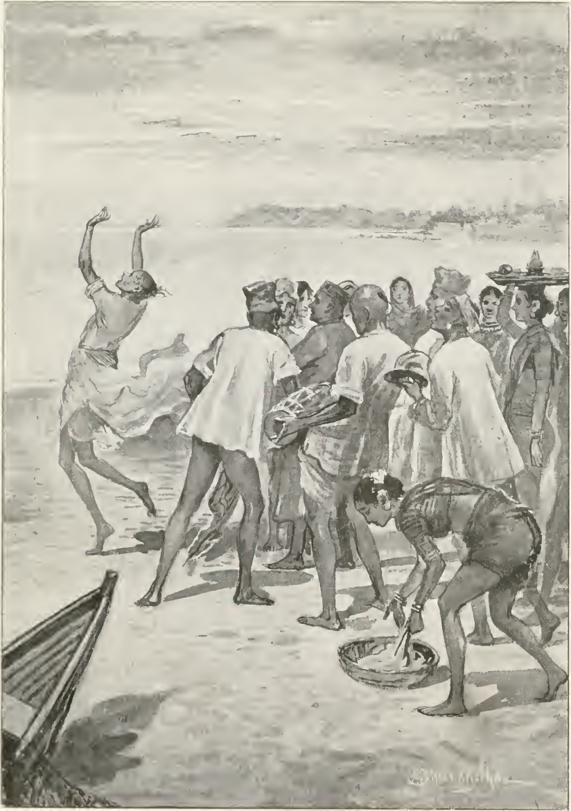
The Spirit of Chandrabai.