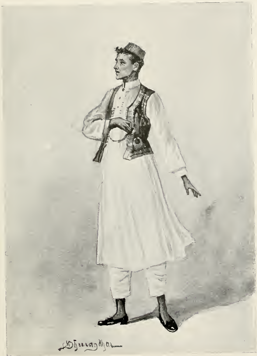
A Bombay Memon.