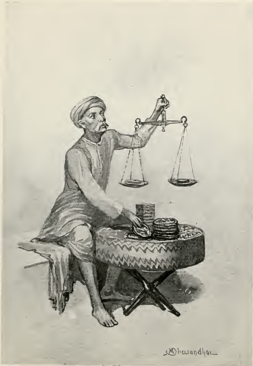
The seller of "Malpurwa jalebi".