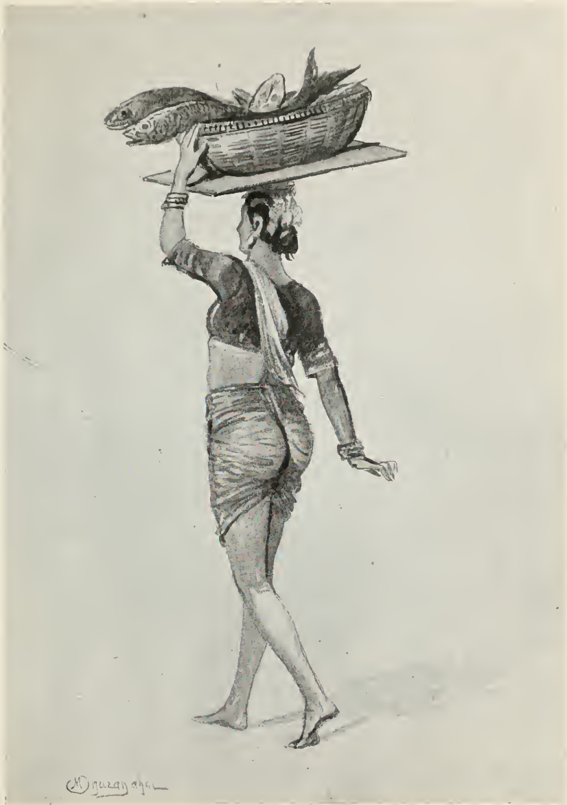
A Koli woman.