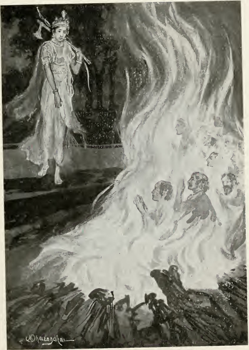
Parashurama and the Chitpavans.