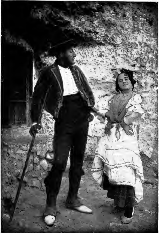
"A little saint with a color more lightful than orange."