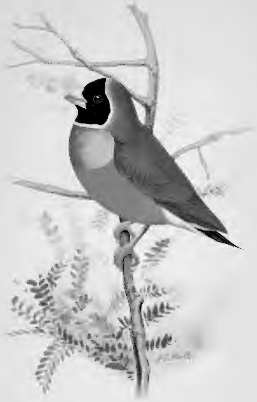
LADY GOULD FINCH.