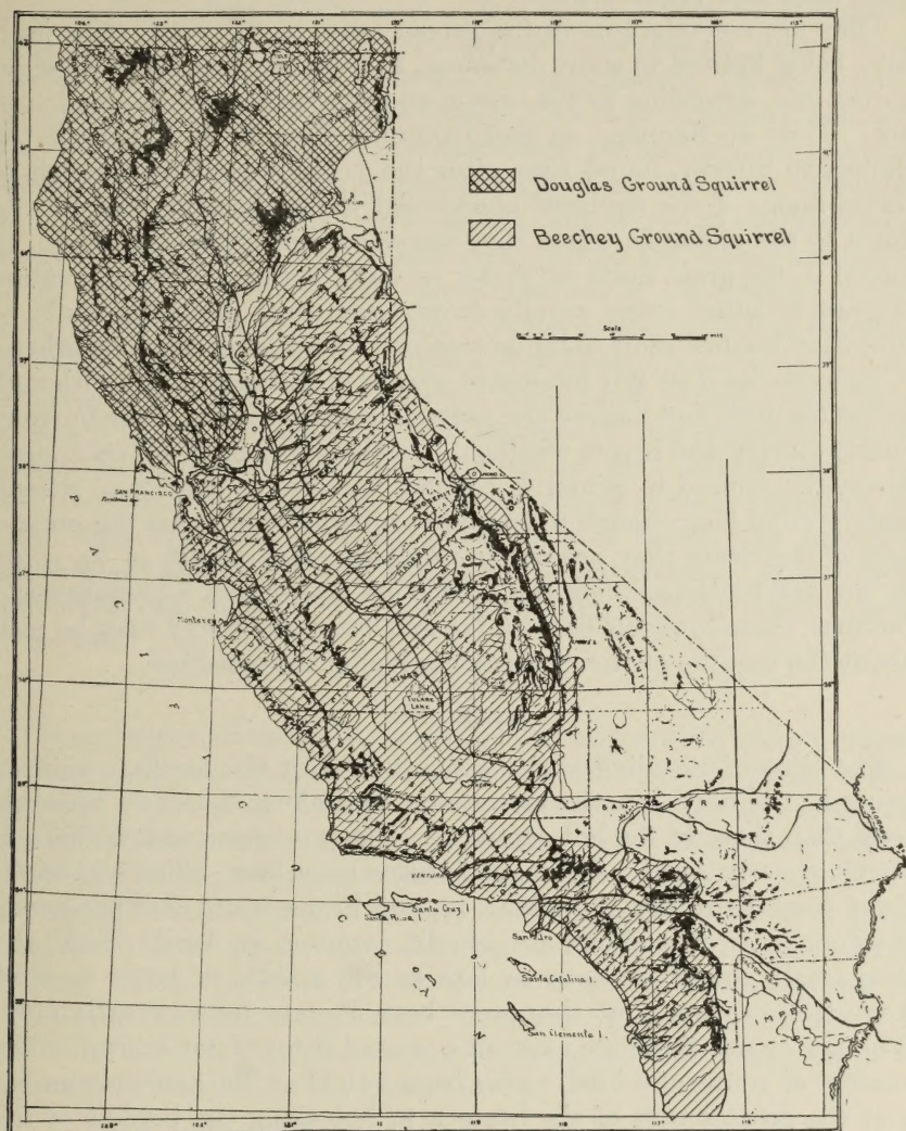
FIG. 2.—Map showing distribution of Beechey and Douglas ground squirrels.

form a conspicuous network. The earth brought up from each burrow is deposited at its mouth to form a gradually-enlarging hillock, and colonies on the plain may be recognized at a distance by the mounds.