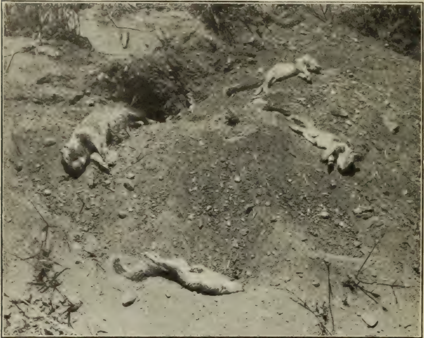
FIG 4.—Ground squirrels killed by poisoned green barley heads at mouth of burrow.

In the experiments carried on by the Biological Survey at Modesto, in Stanislaus County, Piper found that in November, after the winter rains had set in, the squirrels had ceased storing food and no longer carried the grain away in their cheek pouches, but hulled it on the spot and ate the kernel, casting off the outside and thus escaping the poi-