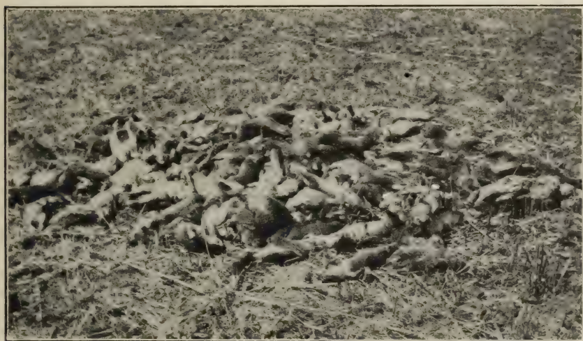
FIG. 3.—Result of poisoning 6 acres at Capistrano.

coated grain, except during the rainy season, yields far better results than soaked grain, and kills the animals more quickly, so that they are much more likely to die above ground, where they can be seen. The success of poisoning with coated grain is due largely to the squirrel's habit, during the dry season, of gathering seeds and carrying them home in its cheek pouches. The cheek pouches are muscular sacs, one on each side of the jaw and throat, each large enough to hold about 200 kernels of barley. Much of the food carried in the cheek pouches is not eaten at the time, but taken to underground storehouses where it is kept for winter use. When grain coated with a properly prepared strychnine solution is carried in the pouches, enough of the poison is dissolved and absorbed to kill the animal at once. Piper made the important discovery that strychnine is far more quickly absorbed by the cheek pouches than by the stomach, and