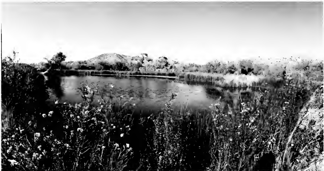
Checklist of Plants of Southwestern Arizona. Figure 5. Organ Pipe Cactus National Monument. Quitobaquito pond including Baccharis salicifolia in foreground, and Populus fremontii , Schoenoplectus americanus , Typha domingensis in background. 29 Sep 2011.