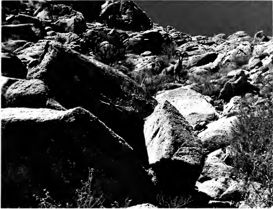
Checklist of Plants of Southwestern Arizona. Figure 6. Tinajas Altas Mountains. Desert bighorn ram and including Bursera microphylla and Hyptis albida . 16 Apr 2011.