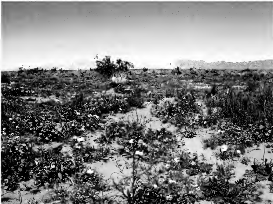
Checklist of Plants of Southwestern Arizona. Figure 3. Cabeza Prieta National Wildlife Refuge. Pinta Sands, 27 Mar 2010. Spring annuals including Abronia villosa , Brassica tournefortii in foreground, Cryptantha angustifolia , and Oenothera deltoides .