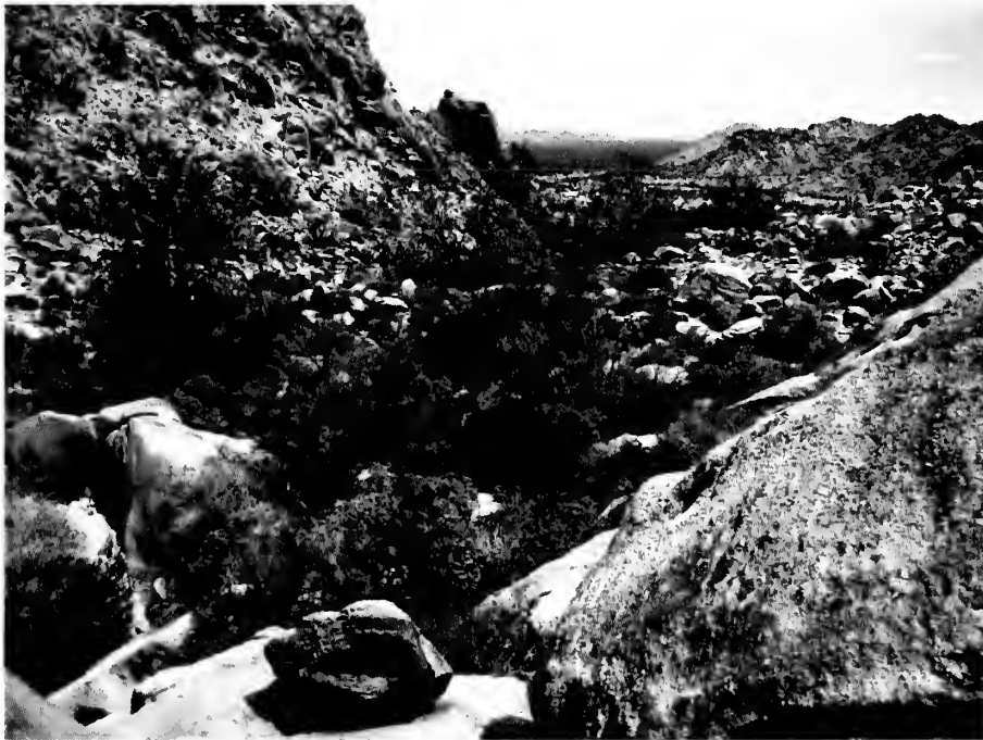
Checklist of Plants of Southwestern Arizona. Figure 7. Tinajas Altas Mountains, Surveyors Tank Canyon, looking eastward. Canyon bottom vegetation including Encelia farinosa , Olneya tesota , Prosopis glandulosa , and Senegalia greggii . 29 Mar 2010.