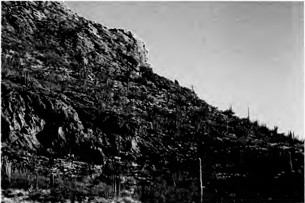
Checklist of Plants of Southwestern Arizona. Figure 4. Organ Pipe Cactus National Monument. Southeast-facing slope in the southern Diablo Mountains with saguaros ( Carnegiea gigantea ) and organ pipes ( Stenocereus thurberi ). 12 Apr 2006.