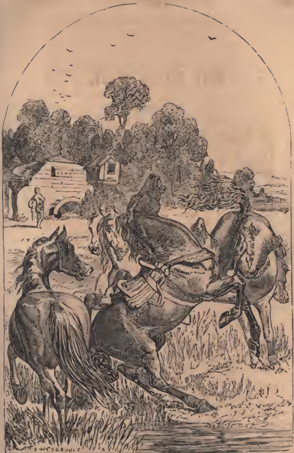
The Reves Tale.