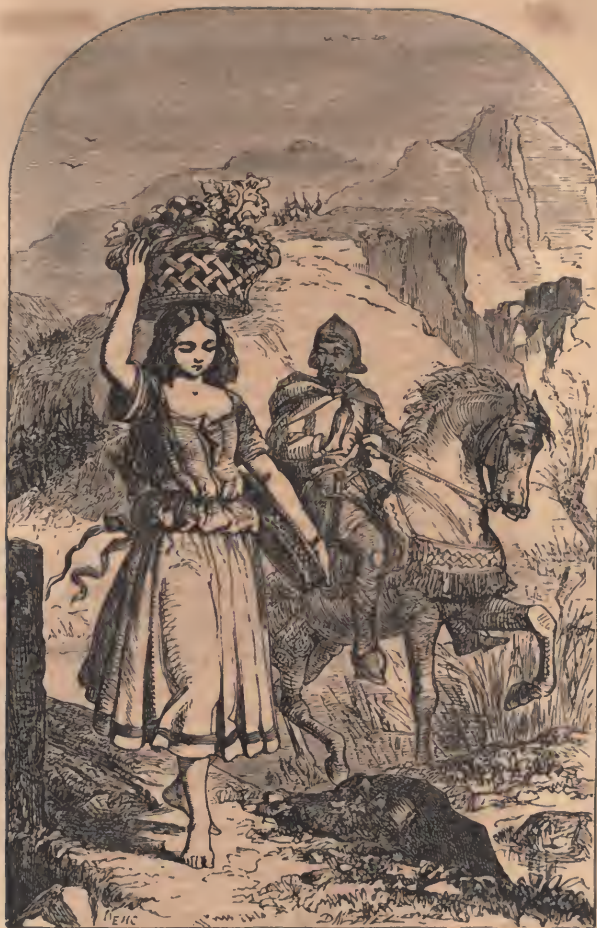
Y e Wif of Bathes Tale.