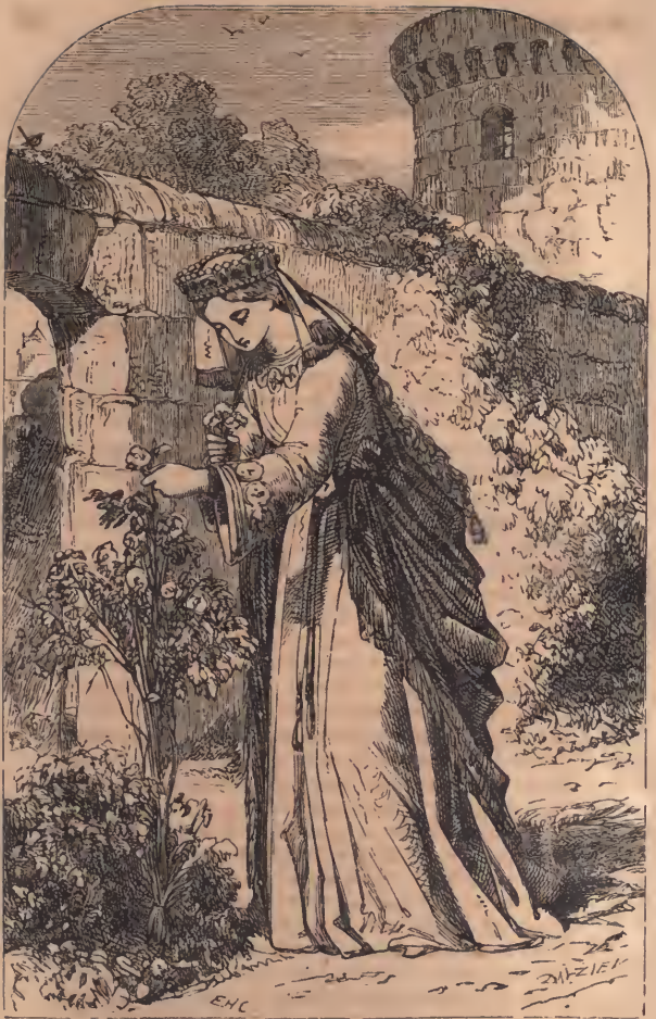
Y° Knightes Tale.