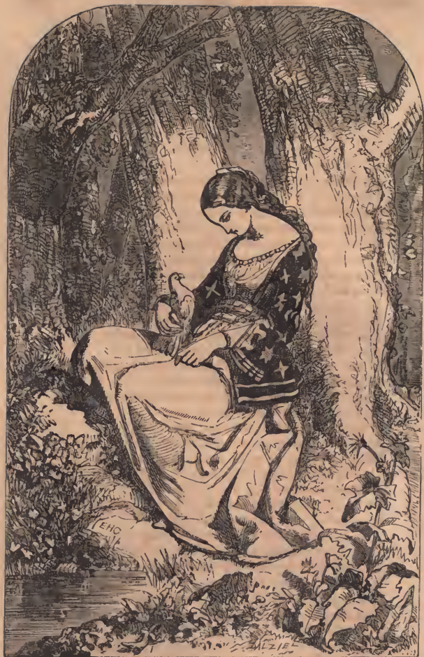
Ye Squires Tale.