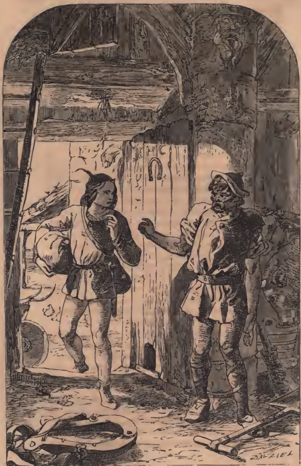
Ye Nonnes Priestes Tale.