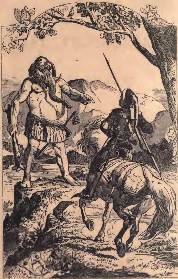
Sire Topas and y e gret Glaunt Ollphaunt.