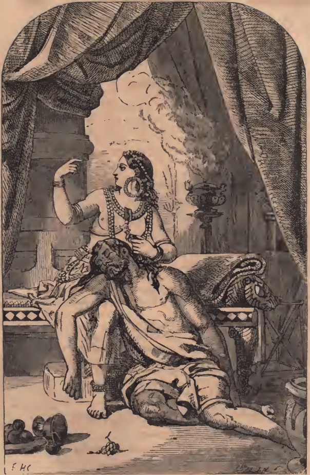
Ye Monkes Tale.