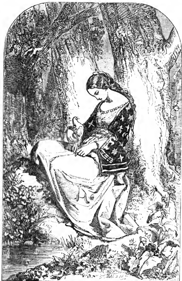
Ye Squires Tale.