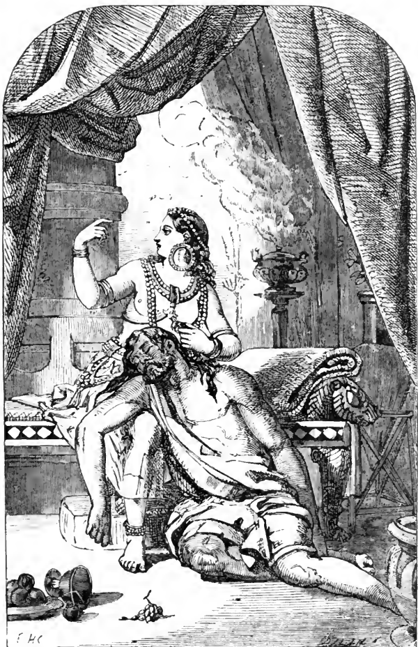
Ye Monkes Tale.