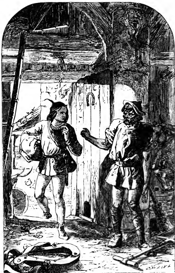
Ye Nonnes Priestes Tale.