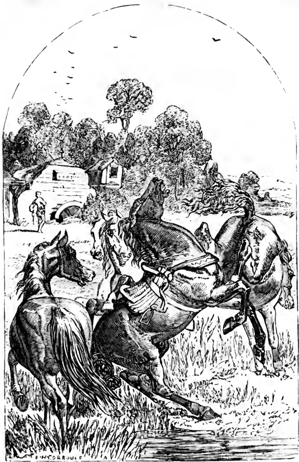
The Reves Tale.