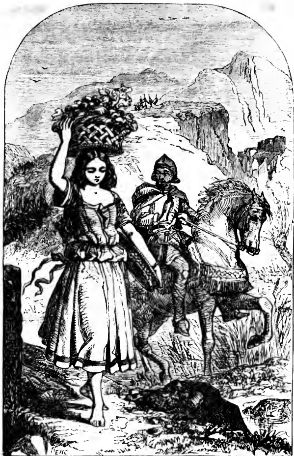
Y o Wif of Bathes Tale.