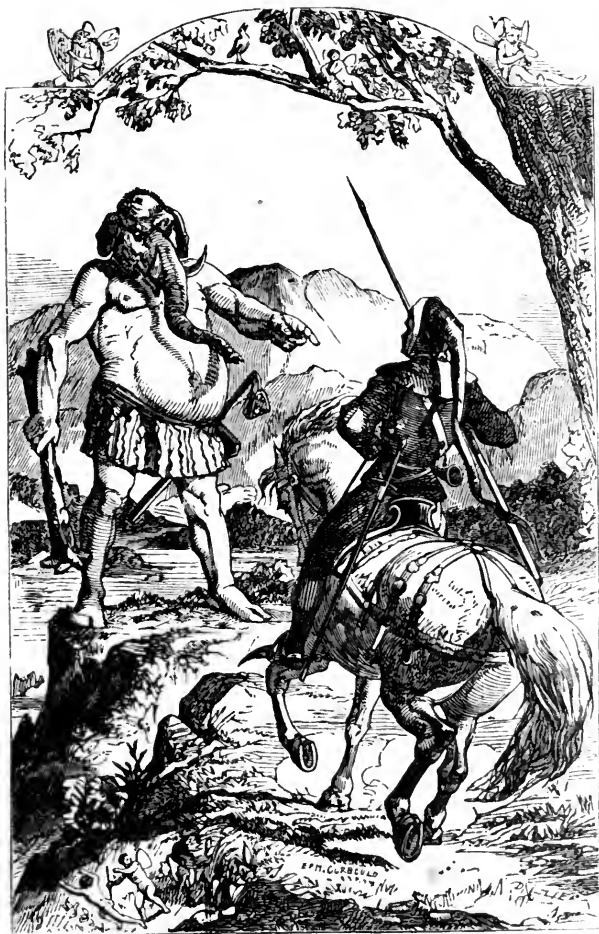
Sire Topas and y e gret Glaunt Ollphaunt.