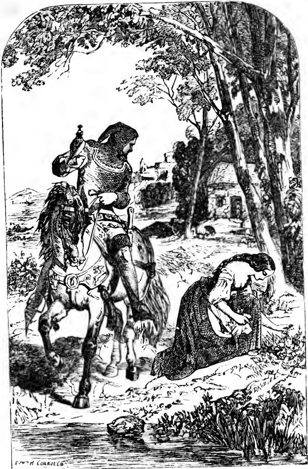
Y° Clerkes Tale.