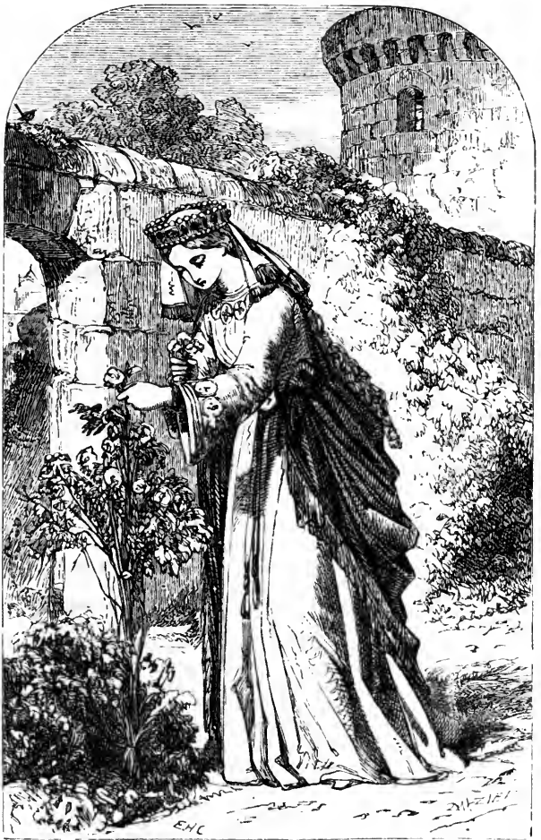
Y° Knightes Tale.