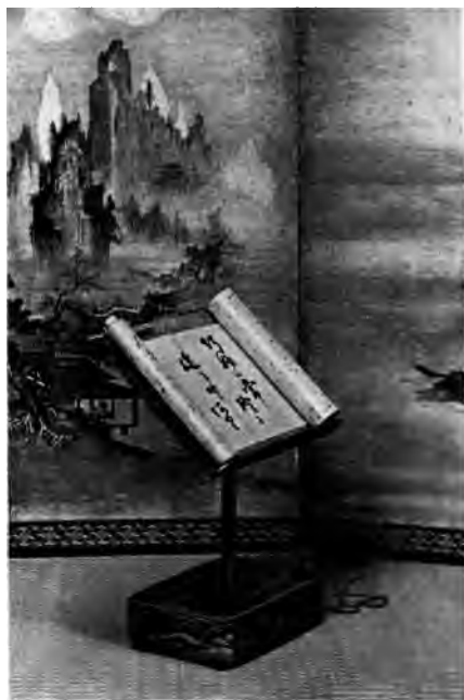
EX LIBRIS RUSSELL GRAY