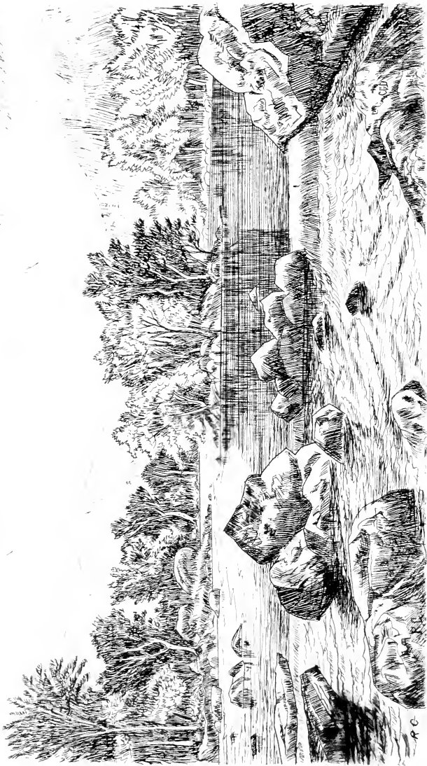
JUNCTION OF FEUGH & DEE.