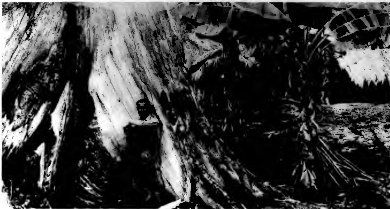
Reconnaissance in Guatemala.