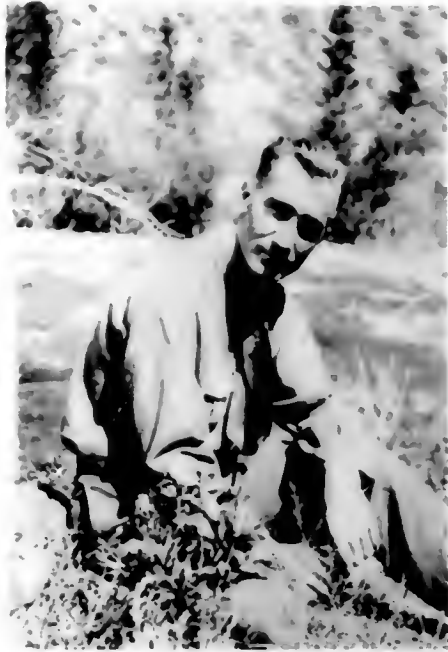
Forest Ranger - 1916