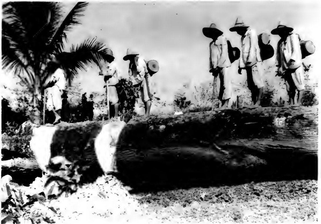
Bringing in wood samples for testing and identification in southern Mexico.