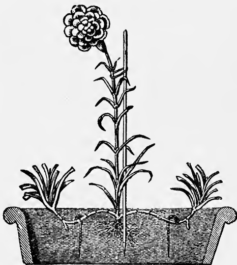
FIG. 2.—Showing how the layers are secured by pegs. (From the Gardeners' Chronicle .)

If slugs attack the plants, it is a good plan to dust over the surface of the ground with soot. If sharp frosts set in, place a thin mulch of decayed stable manure amongst the plants. Notwithstanding all the care that may be taken, some of the layers may get broken, or be injured in some other way during the winter. For this