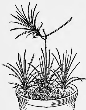
FIG. 1.—Showing how a layer is notched before it is pegged down.

also kills the Carnations. The only plan is to carefully pick out the wireworms by moving the soil over ; but even then many are missed during the process. Fibrous turf in a well-rotted condition is certainly the best material for forming Carnation beds, if the staple soil of the garden is not suitable ; and, as turf is very seldom free from wireworms,