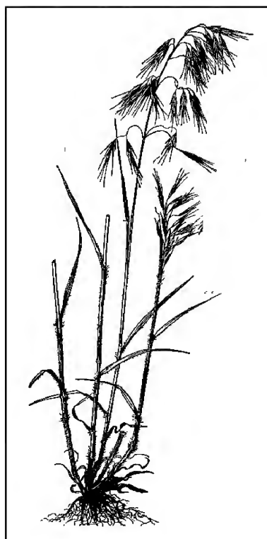
Above: Bromus tectorum , from Hitchcock, A.S. (rev. A. Chase). 1950. Manual of the Grasses of the United States . USDA Misc. Publ. No. 200. Washington, DC. 1950. as posted electronically on the USDA-NRCS PLANTS Database..

will take at least two seeds in a sample.