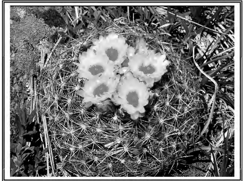
Above: Pediocactus simpsonii (hedgehog cactus). Photo by Robert and Jane Dorn. From: Dorn and Dorn 2007. (see book review, p. 4; and the WNPS homepage to see photo in color)

Note: The Wyoming Infrared Observatory (WIRO) is at 9656 ft (2943 m) near Woods Landing, WY. For more information about WIRO, see: www.physics.uwyo.edu/~amonson/wiro/wiro.html . BH