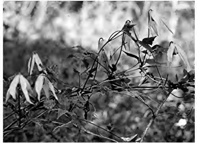
Clematis occidentalis , Lincoln County, Montana

loamy soil. It can be grown from seed. First remove the styles and sow outdoors in fall or cold stratify for 60 days for spring planting. It is also in the nursery trade.