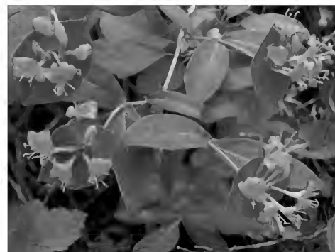
Lonicera dioica , Lawrence Co., South Dakota

Lonicera dioica , Limber Honeysuckle, is a deciduous vine with simple, opposite leaves. Flowers are tubular, yellowish, purplish, orange, or reddish and up to 1.75 inches long. They are clustered at the branch tips above a pair of broad, fused leaves. The fruits are orange-red berries that may be poisonous. The plants occur naturally in moist woods and thickets or edges of woods in the mountains and foothills. They prefer light to moderate shade and moist, cool, loamy, well drained soil. It can be grown from seed sown outdoors in fall or from hardwood cuttings.