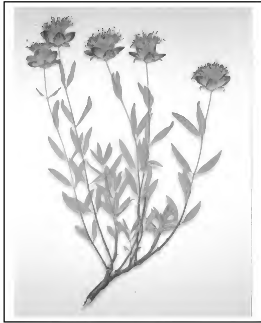
Monardella odoratissima specimen, by Orval Harrison.

My first encounter with this species was along the historic flood plain of Strawberry Creek in Star Valley less than one mile from U.S.89 at an elevation of 6,040 feet. Later, I found it at medium elevations along the south slope of Strawberry Canyon over six miles upstream. Then Ron Hartman located it at a still higher elevation on the same drainage. These locations are all on the west slope of the Salt River Range.