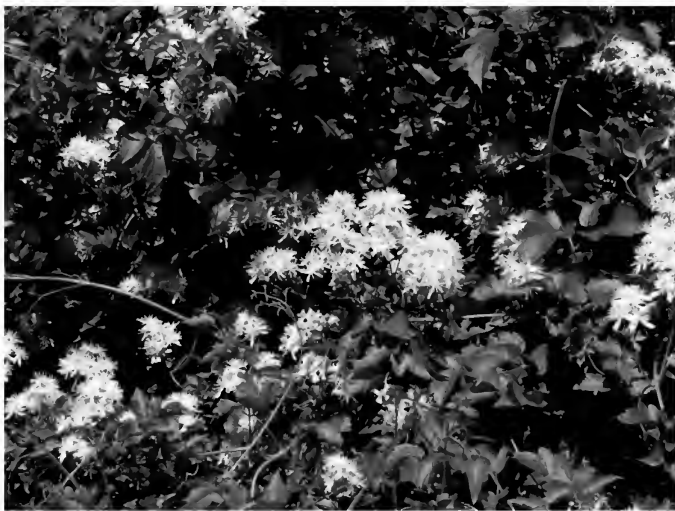
Clematis ligusticifolia , Bonneville County, Idaho

Clematis ligusticifolia , White Virginsbower, is a fast growing, deciduous vine with pinnately compound leaves. The flowers are white to cream and up to 1 inch across with few to many in the leaf axils. Male and female flowers are on separate plants. The female plants will be the most attractive with the fruits being achenes with feathery styles to 2 inches long. The plants occur naturally along roadsides or in thickets usually climbing on fences, trees, or shrubs in the basins, valleys, and plains. They prefer full sun or partial shade and moist to dry, well drained soil. This is a vigorous grower but can be pruned heavily if desirable. It can be grown from seed after removing the styles. Plant in fall outdoors. It is also in the nursery trade.