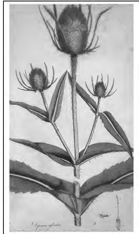
Above: Dipsacus sylvestris .

In October 2011, I had just completed several days of field work in western Wyoming and was beginning the trek home to southern Utah. Hunting season had just opened that morning and I thought it wise to forgo camping for a night in town and the opportunity for a shower and hot meal. It was not quite dusk when I rolled in to the Motel 6 off the