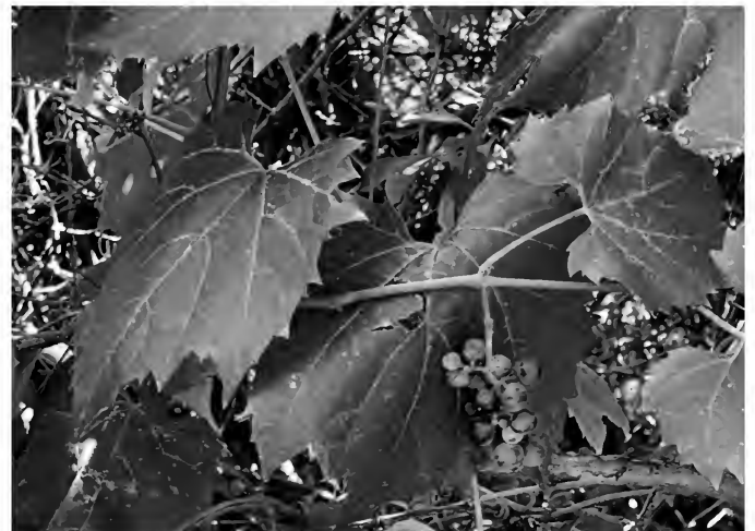
Vitis riparia , Platte and Albany Counties

Vitis riparia , Riverbank Grape, is a deciduous vine with tendrils and is a strong climber. The leaves are simple, lobed, and toothed and to 6 inches long and wide. They turn yellow in fall. The flowers are inconspicuous but fragrant. The fruits are in clusters, dark purple to black, with each fruit about 0.4 inch across. They are tart but edible. The plants occur naturally in riparian forests and thickets in the plains and basins. They prefer full sun or light shade and moist, well drained soil. The plants can climb over trees and shrubs and smother them so plant where there is a non-living structure for them to climb on. It is often grown on a fence and trained into a hedge. It can be grown from seed but the seed may need 5 months cold stratification. It can also be grown from hardwood cuttings and it is in the nursery trade.