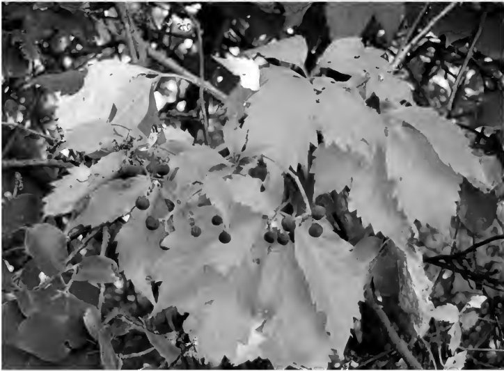
Parthenocissus vitacea , Sioux County, Nebraska