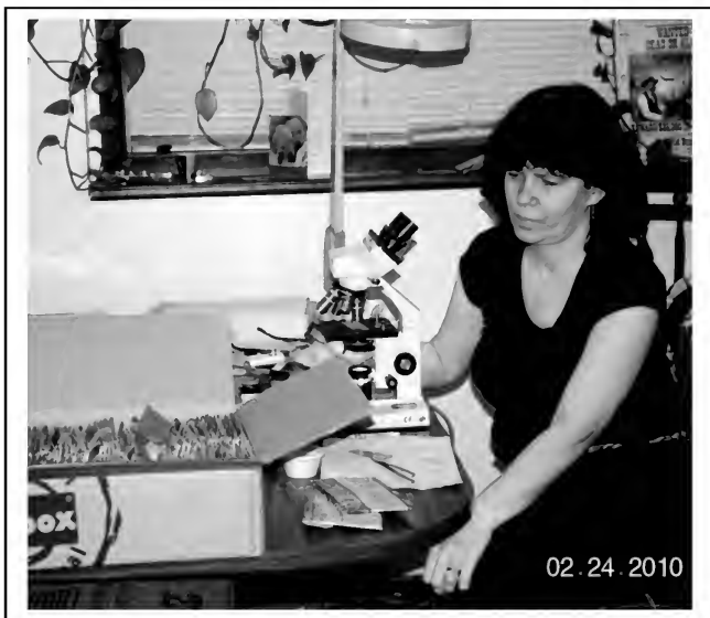
Above: The author studying specimens. Bryophyte species require specially-prepared slide mounts for positive identification and can be identified only under the microscope.

Duplicate specimen of some taxonomic groups are also deposited at: