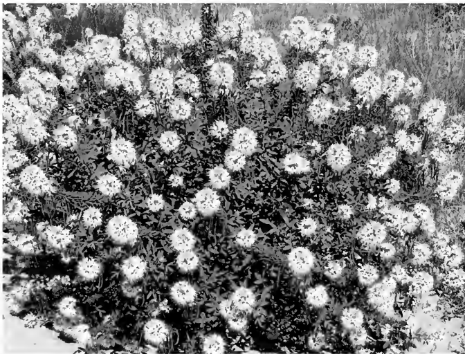
Cleome serrulata , Goshen County

Cleome serrulata , Purple Beeplant, can grow to 6 feet tall and wide with a thick stem and large taproot. Most commonly it is 3 feet or less tall. The leaves are compound with 3 narrow leaflets each to 3 inches long. The flowers are pale pink to lavender, rarely white, to 1 inch across, and clustered at the tips of the many stems and branches. They bloom for a relatively long period between July and September.