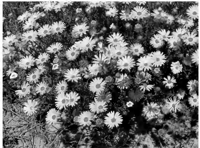
Machaeranthera tanacetifolia , Goshen County