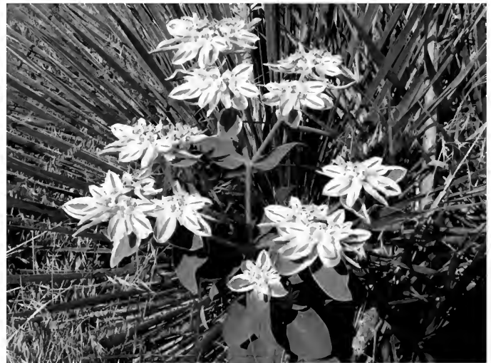
Euphorbia marginata , Crook County

Euphorbia marginata , Snow on the Mountain, grows to 2 feet tall and 8 inches wide. The leaves are up to 4 inches long and about half as wide, the lower usually blue-green and the upper with increasing amounts of white on their margins, the uppermost almost entirely white with a green midrib. The flowers are inconspicuous. The plants are grown for the leaf appearance which resembles a white poinsettia. The seed capsules explode spreading seeds widely, but being an annual, the plants are easy to keep controlled. The plants occur naturally in disturbed areas on the plains. They prefer full sun or light shade and loose, well drained soils. The plants are considered poisonous and some people develop a rash when their skin is exposed to the milky juice. They are easily grown from seed sown in spring. It is also in the nursery trade.