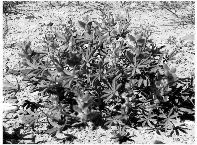
Lupinus pusillus , Goshen County

Machaeranthera tanacetifolia , Tanseyleaf Spinyaster, grows to about 18 inches tall and 12 inches wide. The leaves are finely dissected and to 2.5 inches long. The flowers are sunflower-like but smaller, the rays light blue to lavender and the central disks yellow, the flower heads up to 1.5 inches across with many heads per plant at the tips of stems and branches. It has a long blooming period from July to September. The plants occur naturally in dry open areas of the plains and basins often in disturbed or sandy soils. They prefer full sun and dry, well drained, loose soil. It can be grown easily from seed which is commercially available.