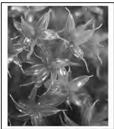
Syntrichia ruralis , by Y. Kosovich-Anderson

hours on the alpine tundra of the highest peaks of the Snowy Range in search of the rare and tiny arctic-alpine moss Stegonia , slogged through the subalpine fens of the Wind River Range to find three-rowed Meesia , hiked miles in the Laramie Mountains to finally discover the