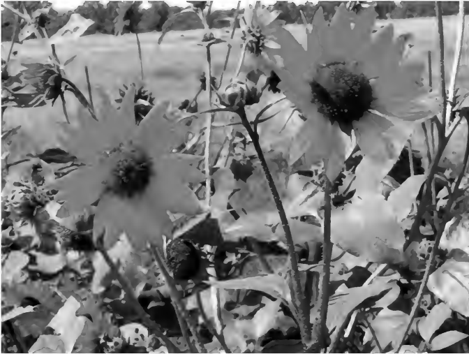
Helianthus annuus , Goshen County

in the following year, remove the plants including roots in late fall since the remains can inhibit other plants. The plants occur naturally in disturbed areas in the basins, valleys, and plains. They prefer full sun and loose, well drained soils. They are easy to grow from seed. There are many cultivars in the nursery trade.