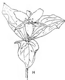
Trillium ovatum