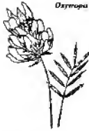
Oxytropis nama Nutt. , a Wyoming endemic collected by Thomas Nuttall on his journey across Wyoming in 1834