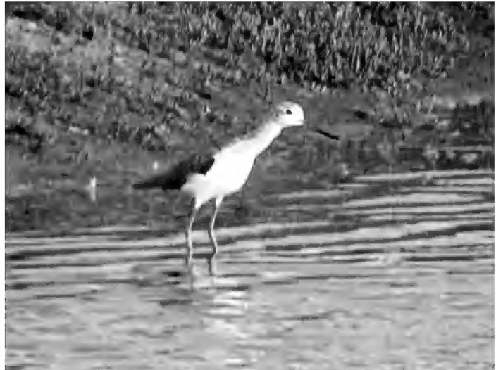
Common Greenshank, Lake Victoria, Bellarine Peninsula

Monthly newsletter of the Castlemaine Field Naturalists Club Inc.