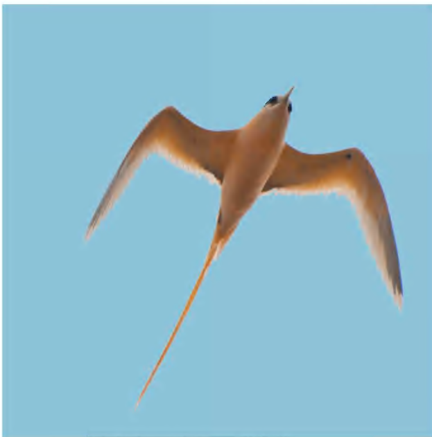
Golden Plover bird