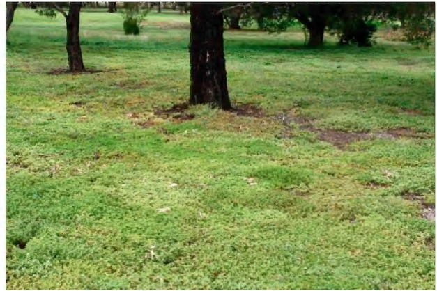
at Belmont golf course 2010