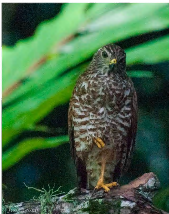
Christmas Island Goshawk, Great Frigatebird, and Robber Crab