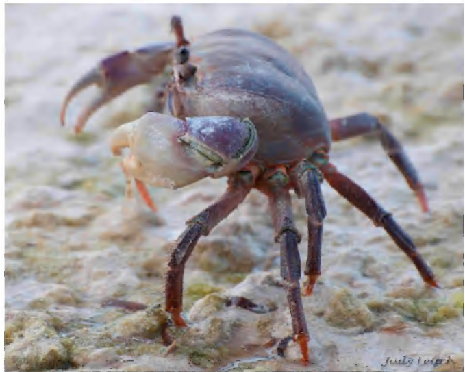
Blue crab, Christmas Island

Monthly newsletter of the Castlemaine Field Naturalists Club Inc.