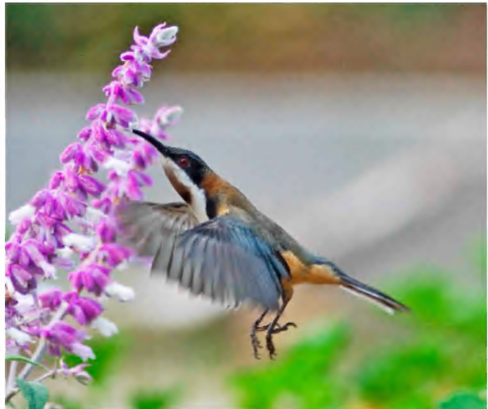
Eastern Spinebill on Salvia. See p2

Monthly newsletter of the Castlemaine Field Naturalists Club Inc.