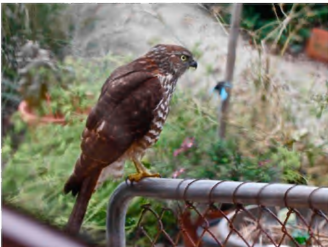
Visitor photo from the kitchen window by Claire Morgan. [ Immature Brown Goshawk? - ED ]