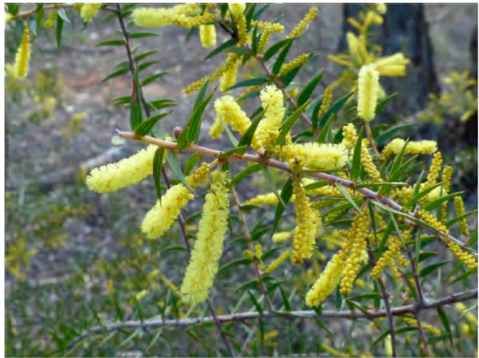
Spike Wattle Acacia oxycedrus, Junction track August 28

Monthly newsletter of the Castlemaine Field Naturalists Club Inc.