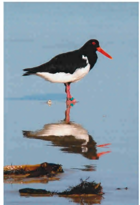
Pied Oystercatcher at Torquay