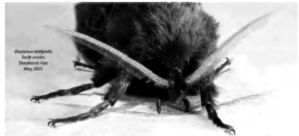
Oxycaenus antipoda (a Swift Moth) Shepherds Flat May 2021