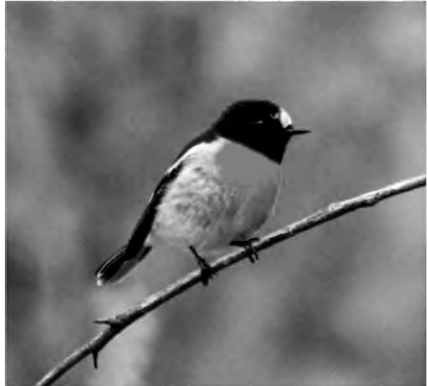
Scarlet Robin

Monthly newsletter of the Castlemaine Field Naturalists Club Inc.