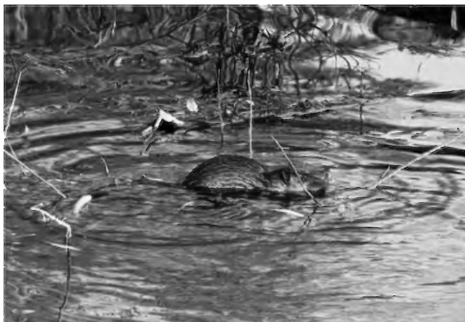
Rakali in Jim Crow Creek. Note the characteristic white-tipped tail.

Geoff returned the following morning (freezing cold) to lead 13 members and 1 visitor along a stretch of Campbells Creek pointing out to us some of the elements of the creek which are conducive to Rakali habitat – native trees along the banks with overhanging branches that drop leaf litter to support the food chain and with roots stabilising the bank, creek-side shrubs and bushes to give shelter from predators, and overhanging banks providing sites for burrows. Willows and similar introduced riparian trees do not provide suitable habitat for either Platypus or Rakali. Variation in the stream is also important with shallow, fast-flowing areas interspersed with pools up to 1.5m deep providing habitat and food for both species. Geoff congratulated the Campbells Creek Landcare group for their excellent work over the years, creating perfect Rakali and Platypus habitat, borne out by their frequent sightings in this area.