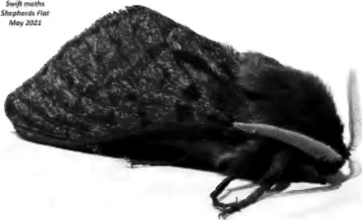
Oxycaenus antipoda Swift moths Shepherds Flat May 2021