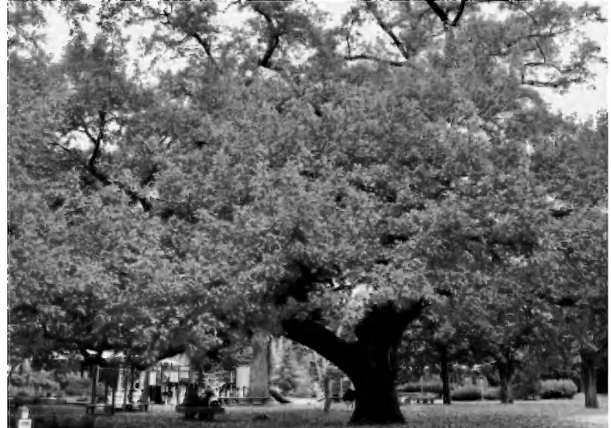
CBG English Oak – “Tree of the Year”

The tree was one of nine shortlisted from the National Trust Significant Tree Register. The winner is chosen by votes, with 'our' tree gaining 625 votes out of a total of 1,590.