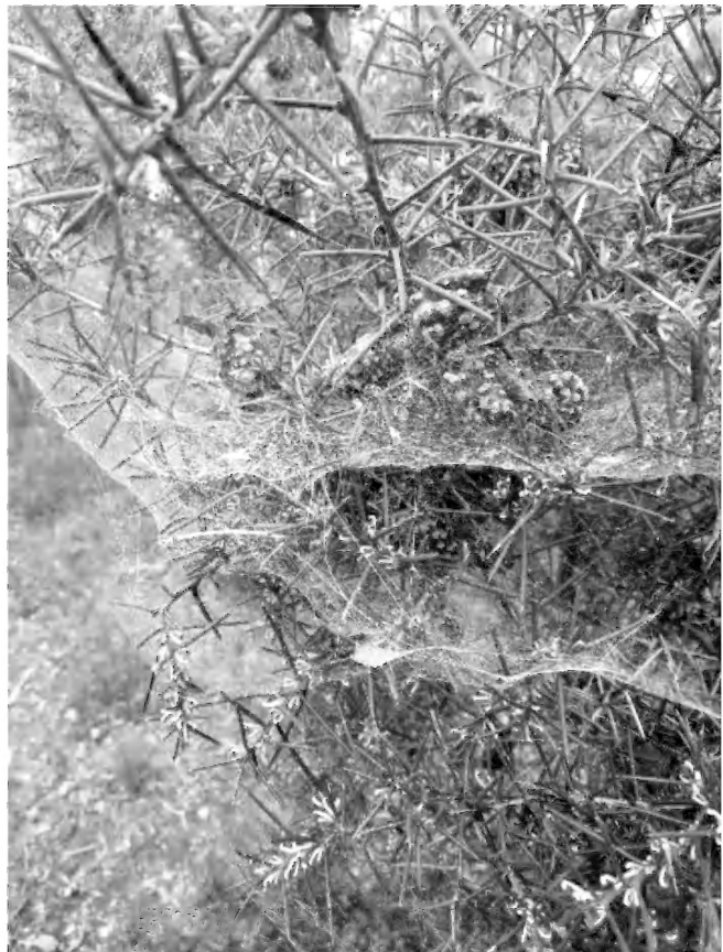
Hammocks of "community spiders" hang in a Hakea bush.

Hammocks of community spiders (as Rita Mills calls them), dead within their webs and slung on their once-bushy habitat, suggested a broiling or other detrimental experience out there on the