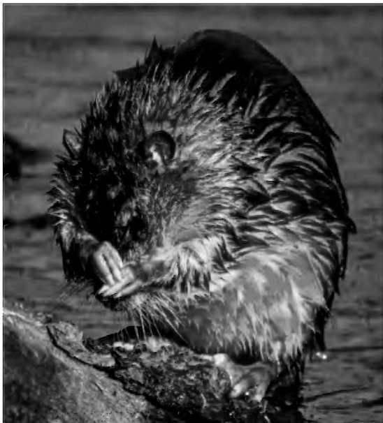
Rakali cleaning its face and whiskers after catching and eating prey. Note the whiskers and webbed hind feet. Lake Wendouree.

The semi-aquatic Rakali shares several attractive characteristics with Otters. Rakali have relatively flat heads with dense large whiskers and strong jaws. The ears are streamlined and can be folded flat against the head. They have dextrous front feet and the hind feet are partially webbed. The thick conical tail is used as a rudder and has the distinguishing white tip which can vary from 50% to 2% of the length of the tail. Sometimes individuals have been recorded as feeding while floating on their back – a behaviour very similar to that of Sea-otters. The Rakali is fairly big by rodent standards - male Rakali and female Platypus are about the same size.