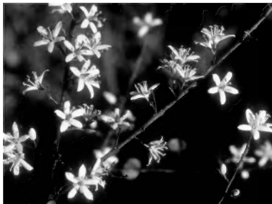
Mapping Sweet Bursaria ( Bursaria spinosa ) bushes will help locate rare Eltham Copper Butterflies.

Under the guidance of local ecologist Elaine Bayes, who successfully applied for a grant to continue Eltham Copper Butterfly monitoring this year, a number of Field Nats members are spending a few hours each week in the bush counting Bursaria bushes. We are doing detailed mapping of potentially good habitat areas for ECBs, with the intent of returning to these areas in summer to see if there are ECBs present. The areas we are mapping are south of Castlemaine, starting along Dingo Park Road where adult ECBs have been found in the past, but where current habitat information is very patchy. In Kalimna Park, this mapping has been found to be a very useful tool for indicating likely locations for the butterflies. The sites being mapped this winter are important, because they are in asset protection zones and therefore subject to burning.