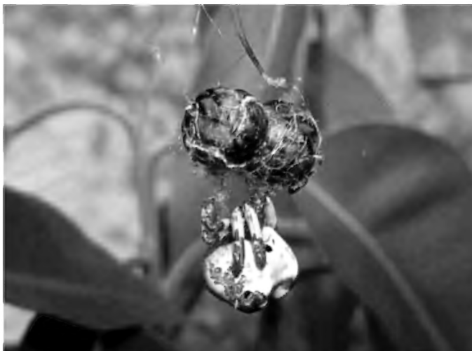
Orchard or Bird-dropping spider with egg sacs

Geelong: Tan Crab Spider. One of the "Huntsman" group. Light in colour it lives under bark and hunts its prey by fleetness of foot