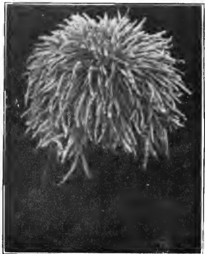
MRS. W. DENNIS

NAG-IR-ROC (Golden Champion) —Finest exhibition yellow ever distributed; color, deepest glowing orange yellow, 45 inches in circumference; every petal reflexing showing the color to the best advantage. This is the variety exhibited at the shows under the provi-