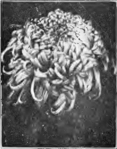
MRS. H. S. FIRESTONE

MRS. H. S. FIRESTONE —The outstanding Novelty of the year; the photograph does not begin to do justice to the flower. It is wonderfully massive, stem perfectly rigid and foliage right up to the flower. Color, pinkish chamois-buff. This variety will be found invaluable in the classes calling for "Any other Color", in the exhibitions. Height 4½ ft. $2.00 each.