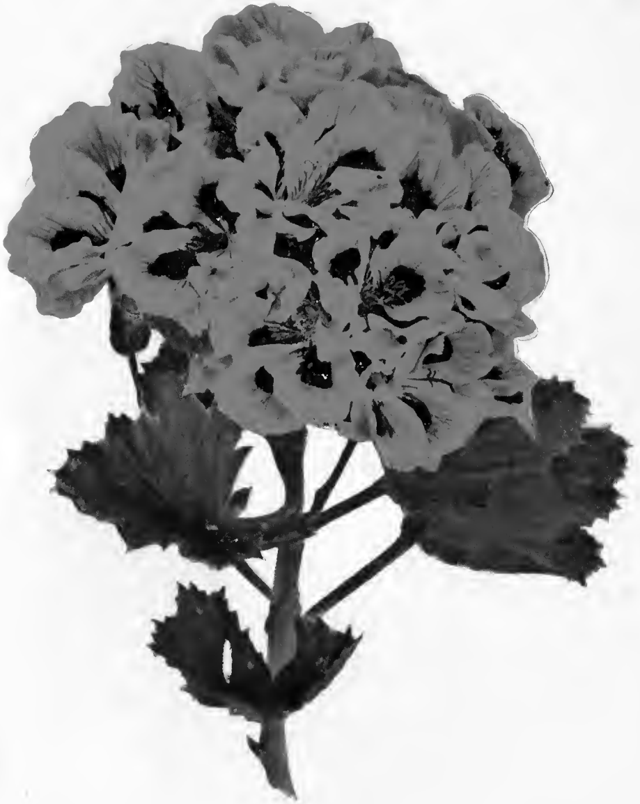
WURTEMBERGIA SPORT OF EASTER GREETING (AN IMPROVED EASTER GREETING)