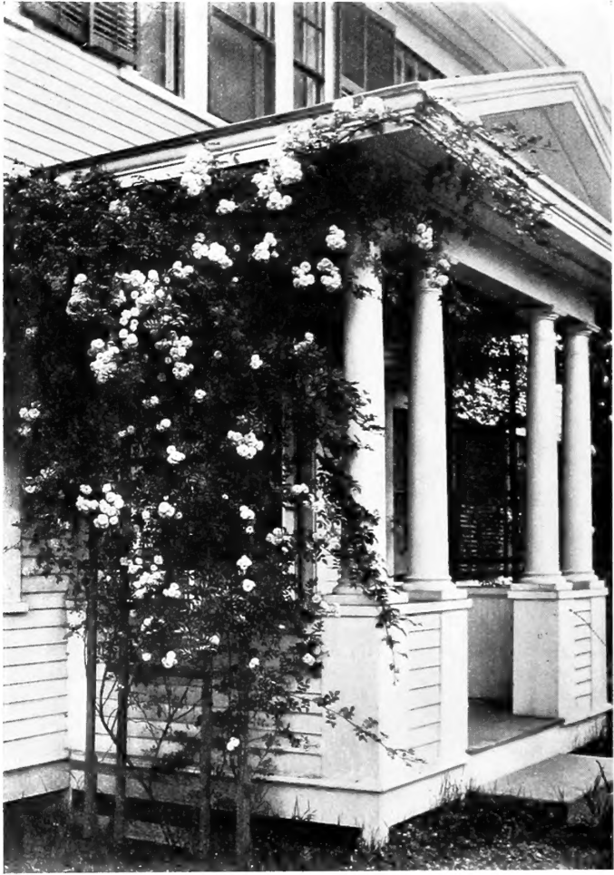
ONE OF OUR DOROTHY PERKINS ROSES, PLANTED ONE YEAR