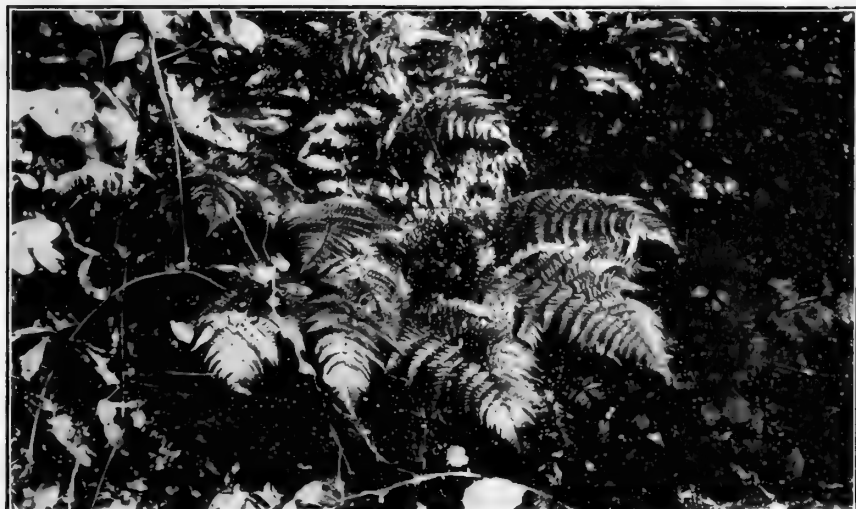
EVERGREEN WOOD FERN— Aspidium Marginale