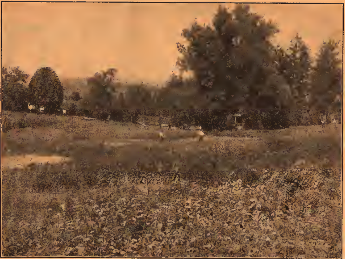
Partial view of Herbaceous Plantations