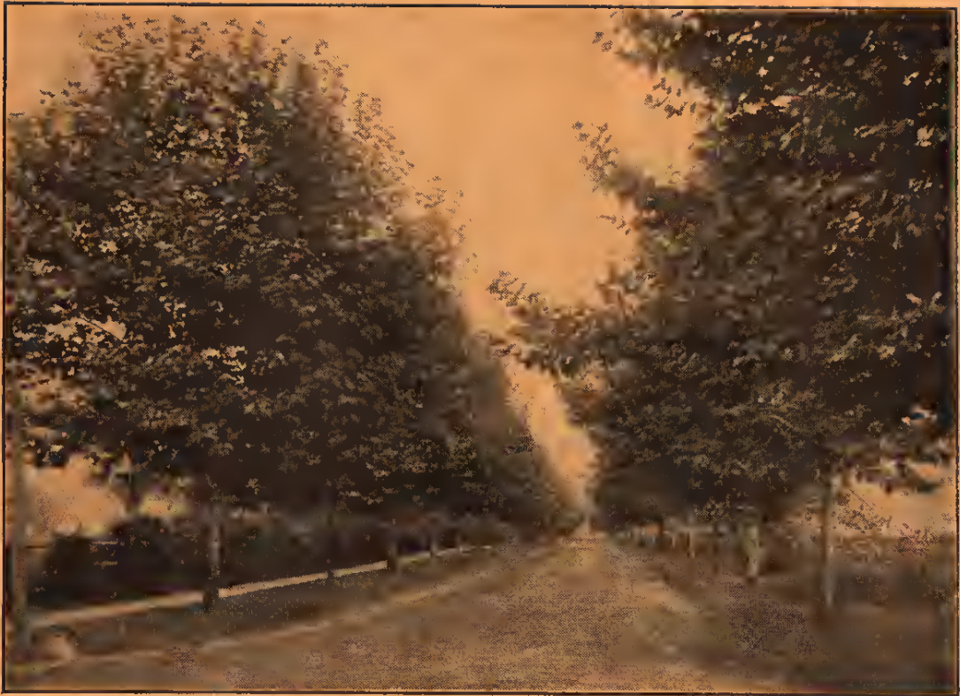
An Avenue of "Andorra-grown" Oriental Planes. (See page 30).