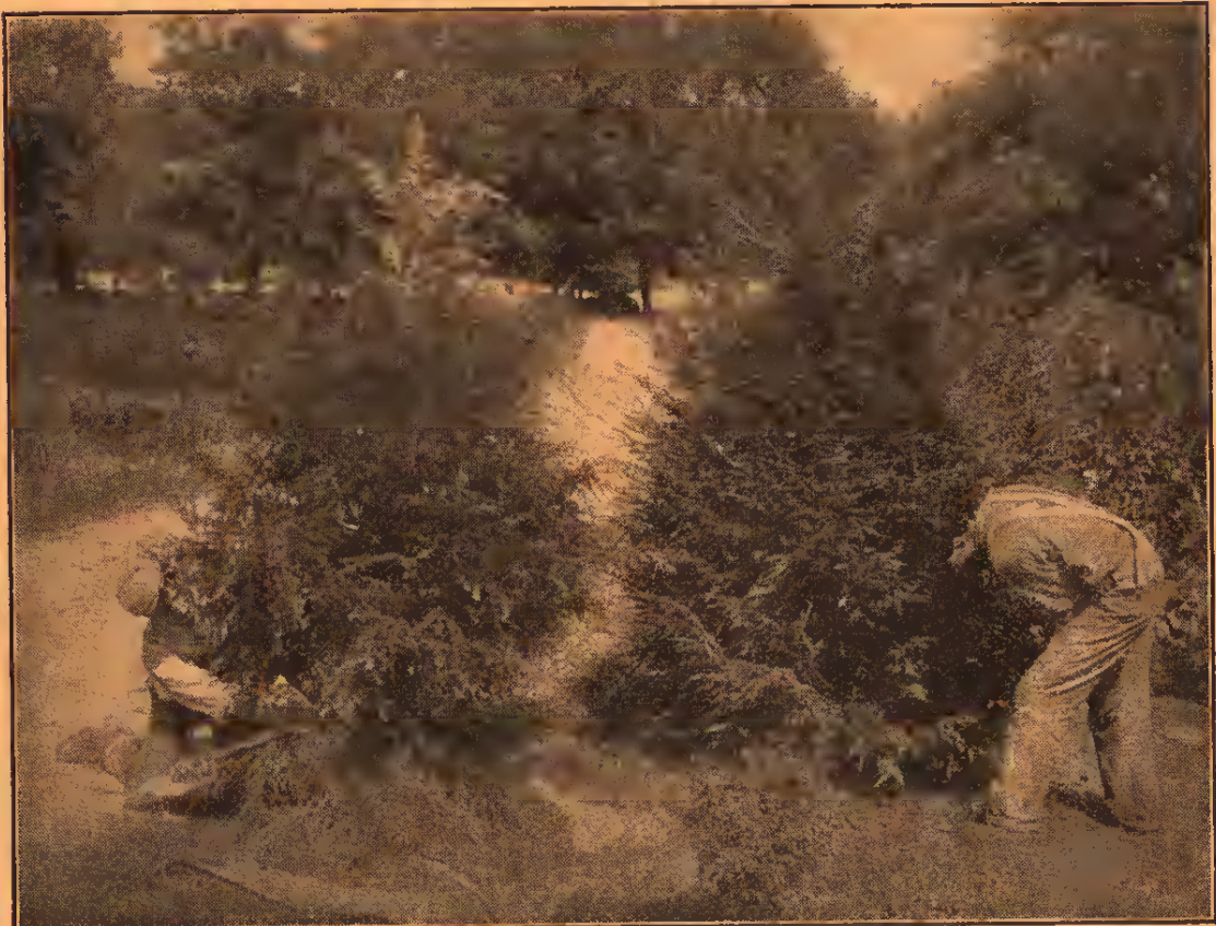
Showing Fibrous Roots of Hemlock.