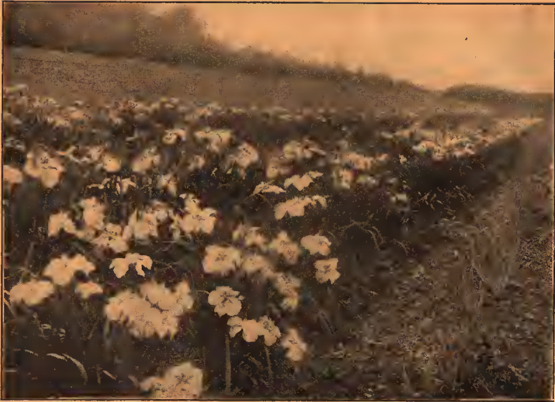
A field of Japanese Iris at Andorra