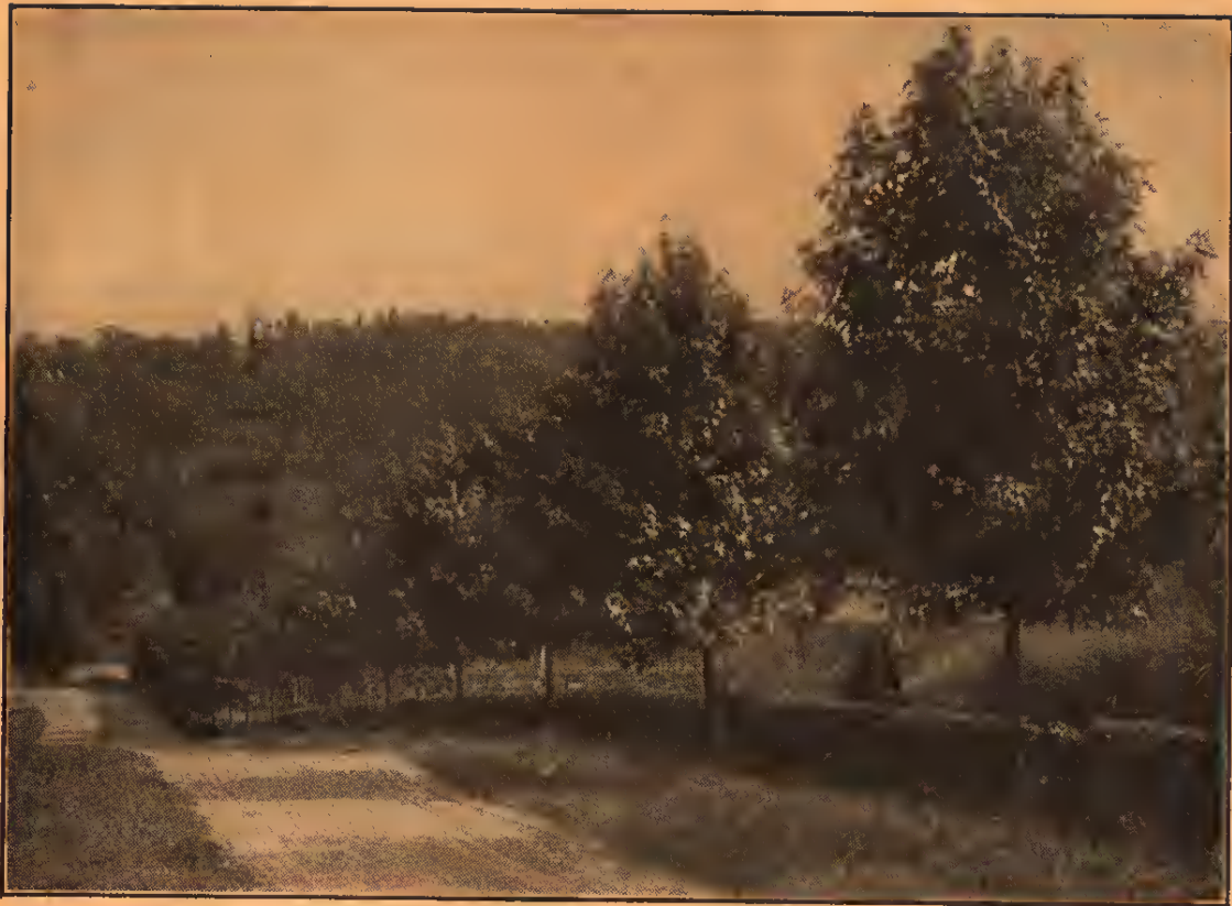
An Avenue of Sweet Gums (Liquidambar), at Andorra.