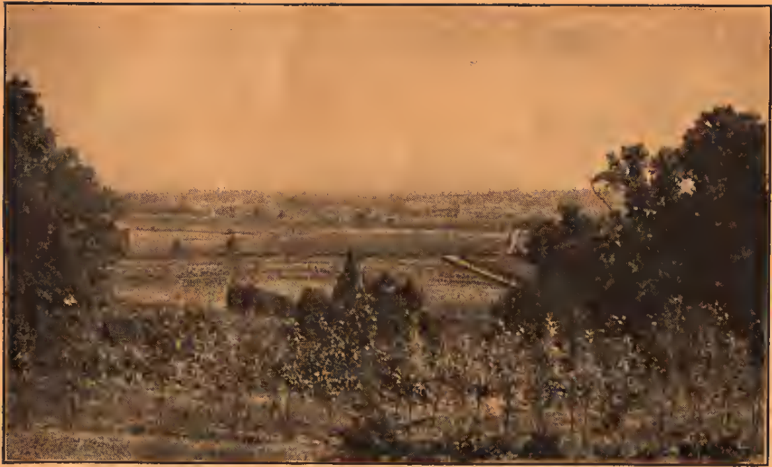
Partial View of Nursery Grounds from Top of Main Nursery.