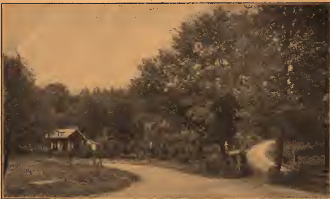
Nursery Entrance and Office.