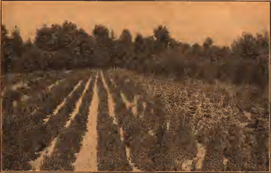
A Block of Box Bush and Evergreens.