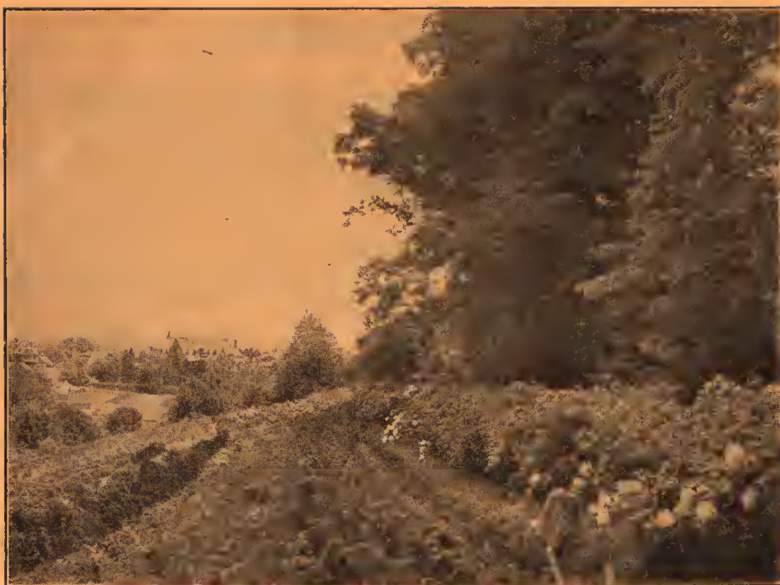
Rhododendrons at Andorra.