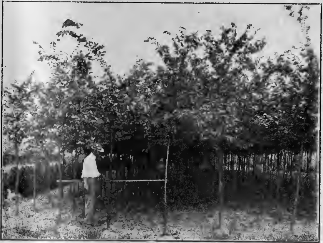
A Block of American White Elm at Andorra.