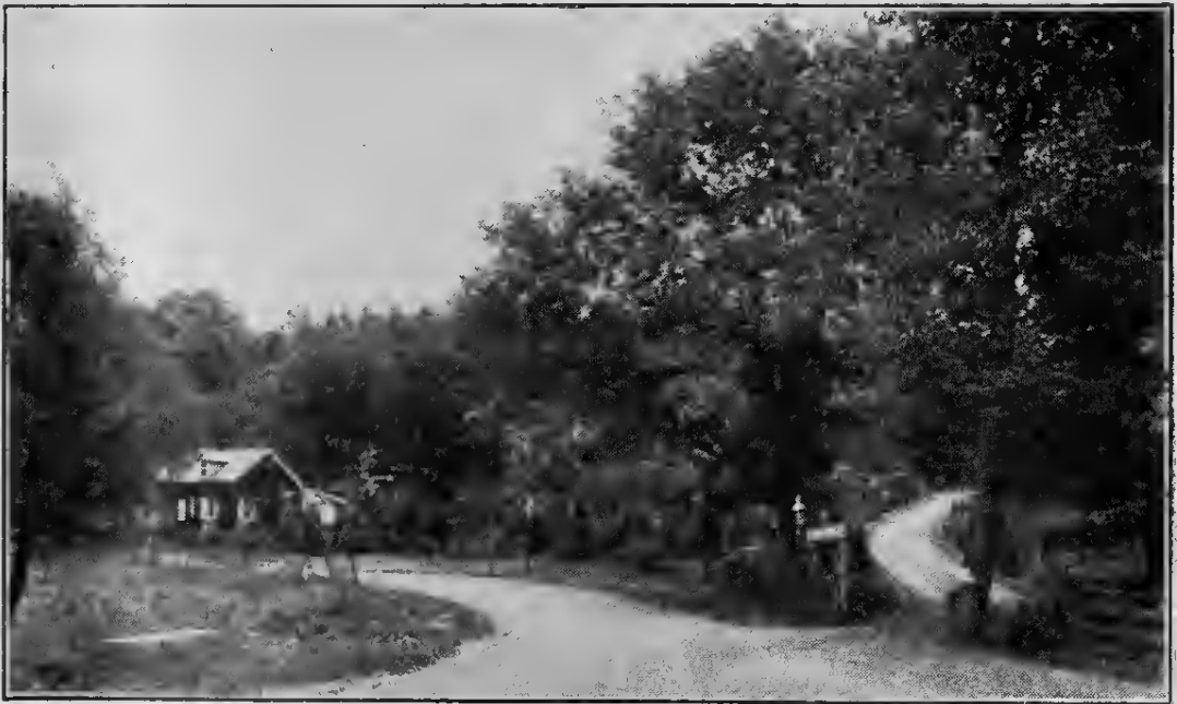
Nursery Entrance and Office.