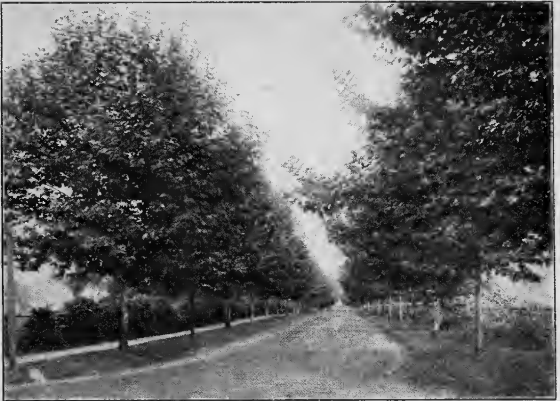
An Avenue of "Andorra-grown" Oriental Planes.