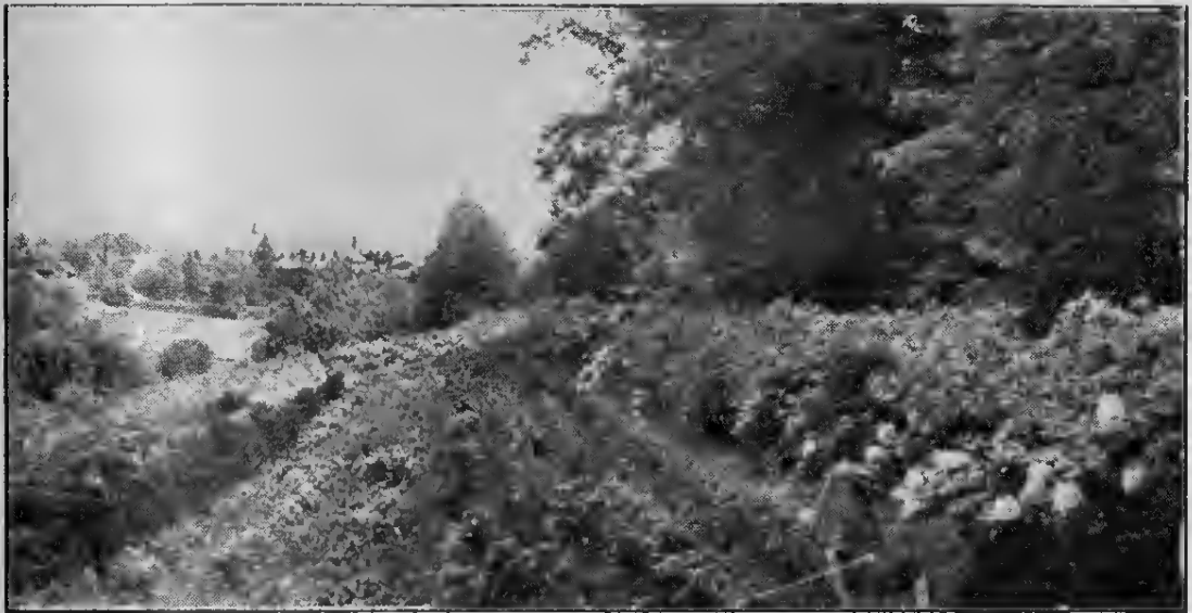
Rhododendrons at Andorra.