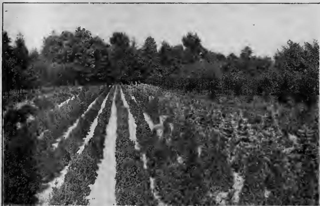
A Block of Box Bush and Evergreens.