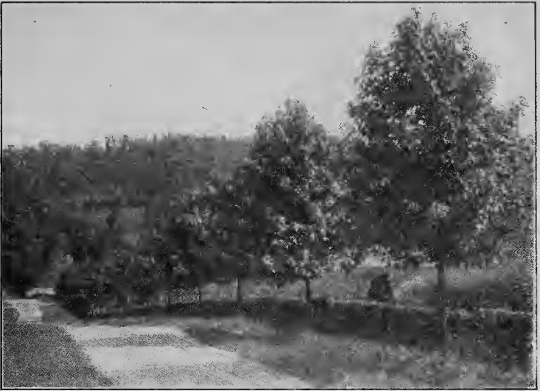
An Avenue of Sweet Gums (Liquidambar), at Andorra.