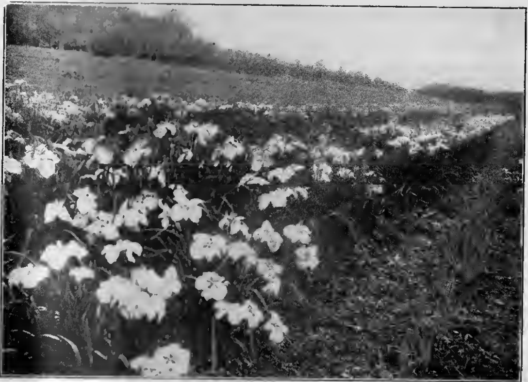
A field of Japanese Iris at Andorra