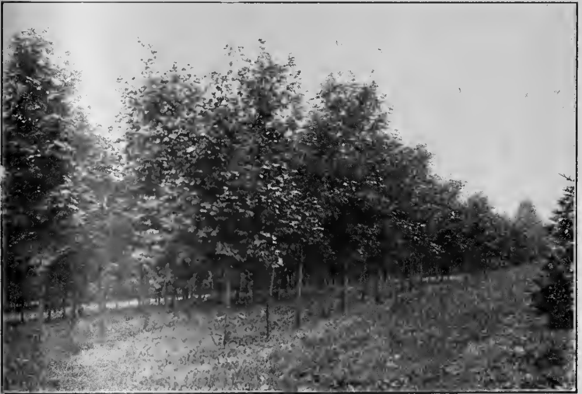
Specimen Norway Maples in Wide Rows.