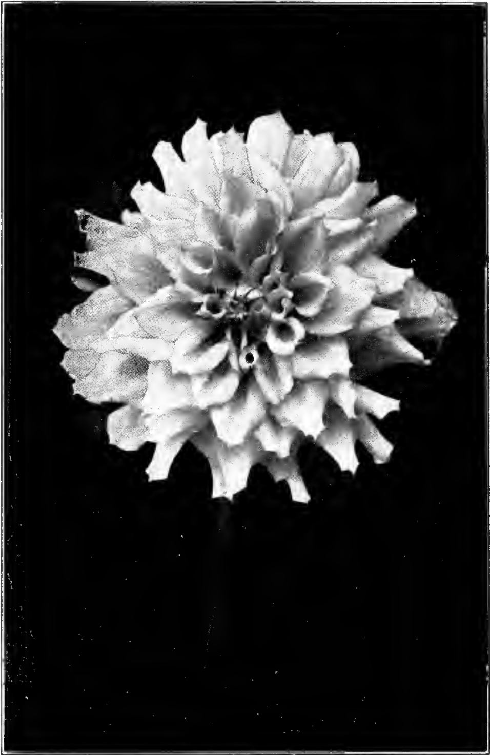
BREAK O' DAY