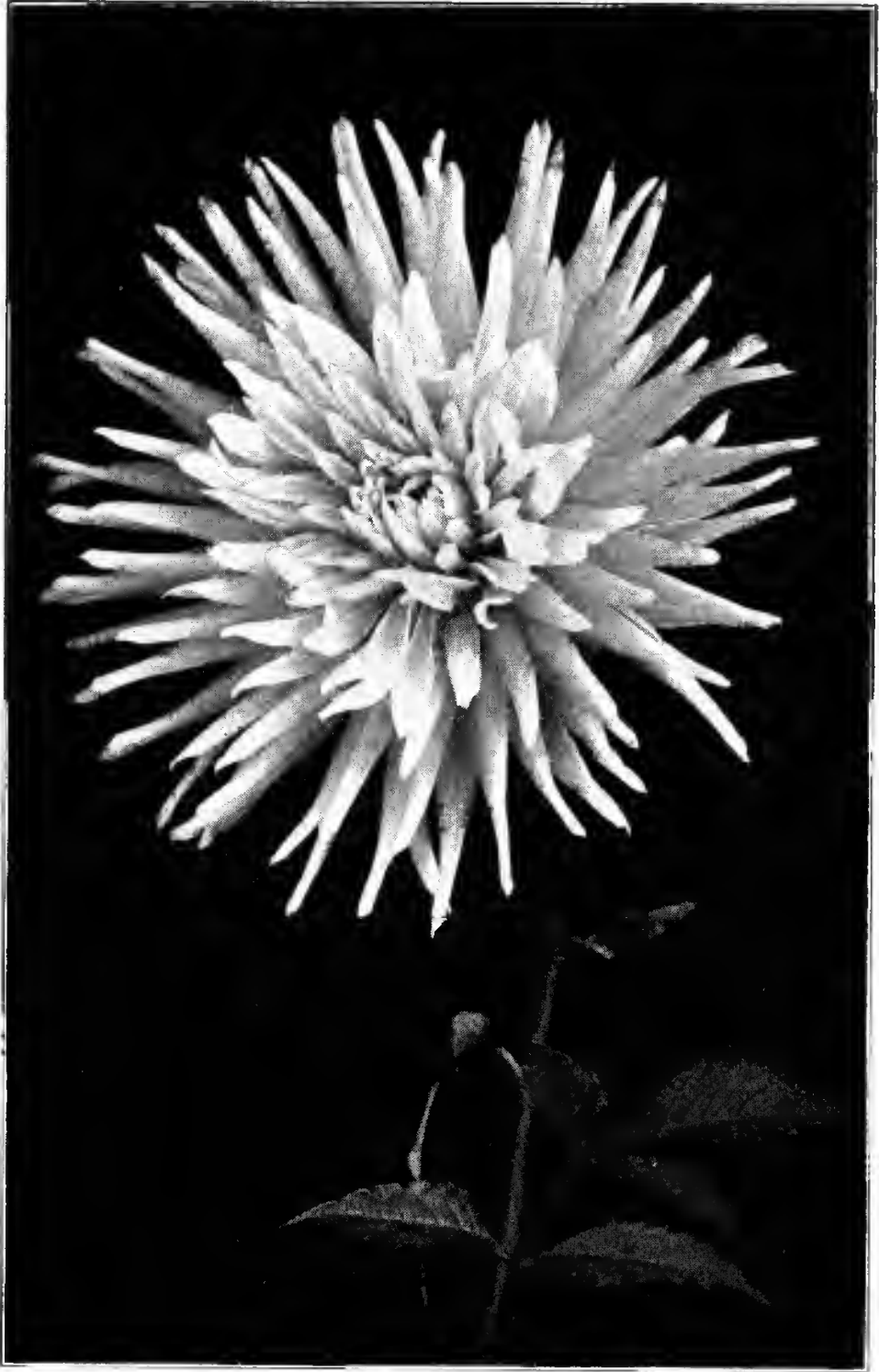
MARGUERITE BOUCHON (CACTUS)