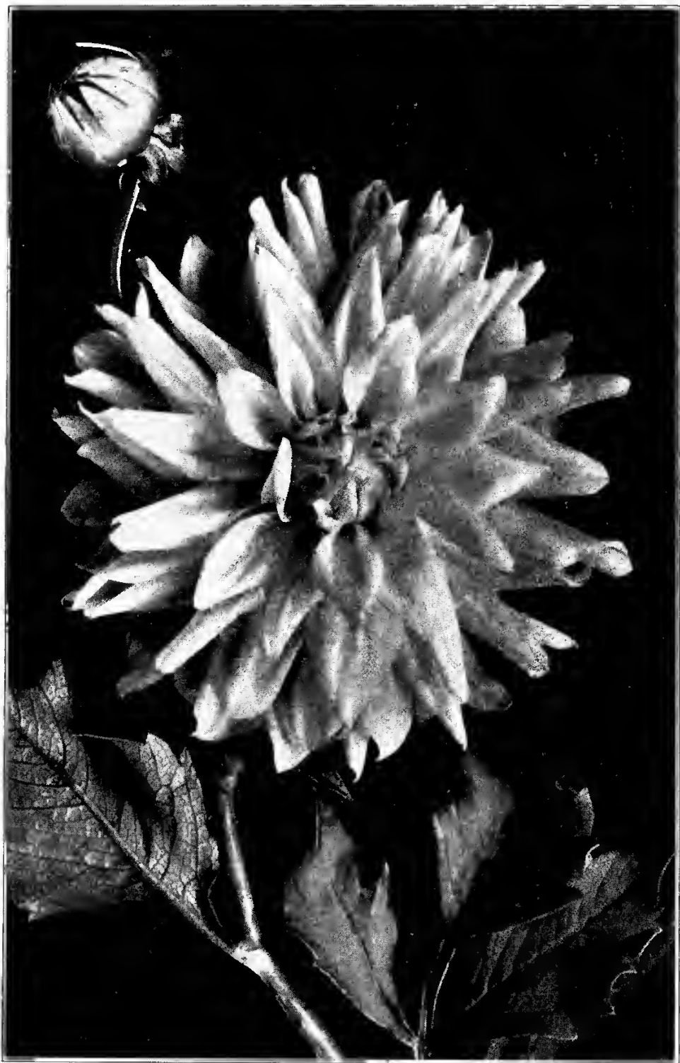
COLOSSAL PEACE (HYBRID-CACTUS)