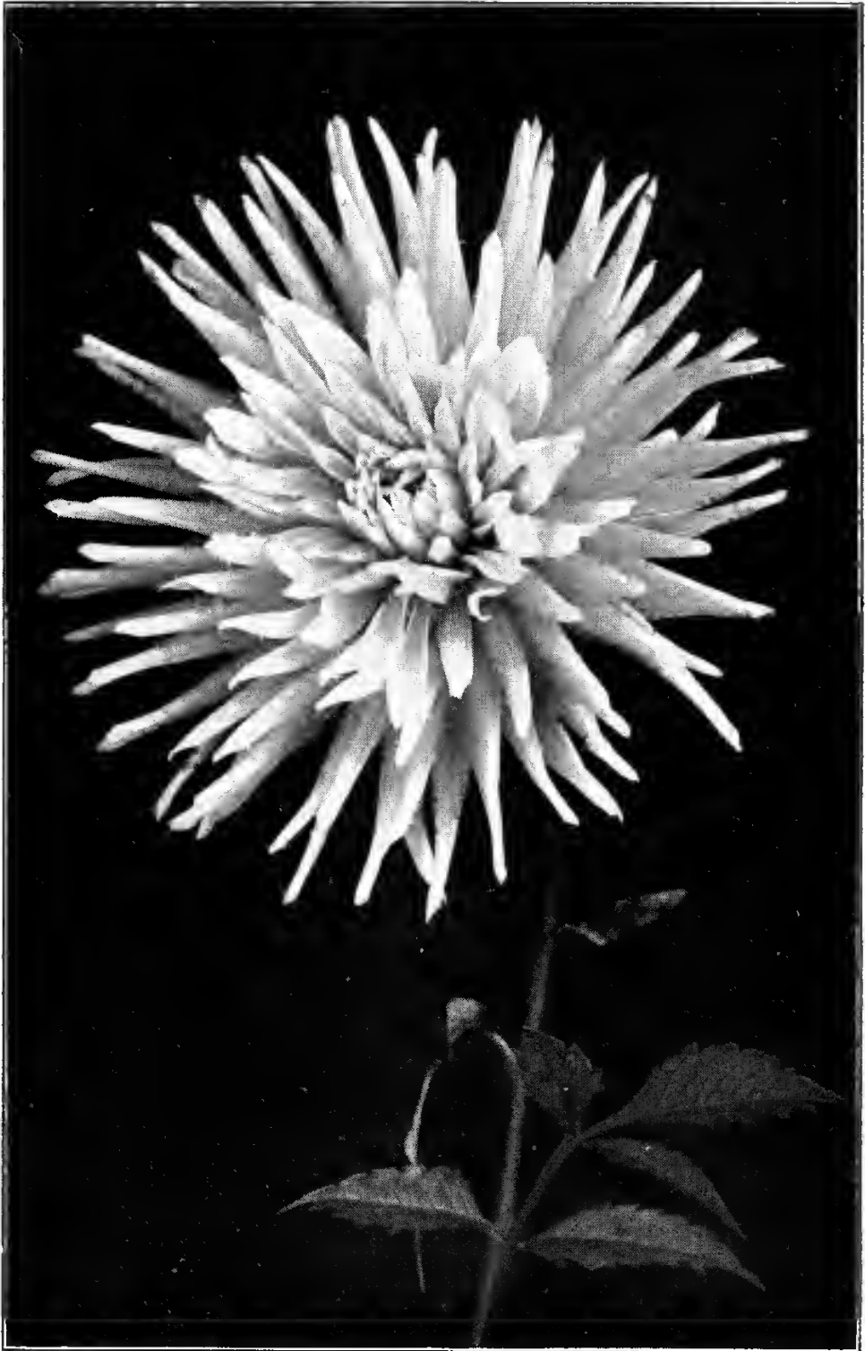
MARGUERITE BOUCHON (CACTUS)