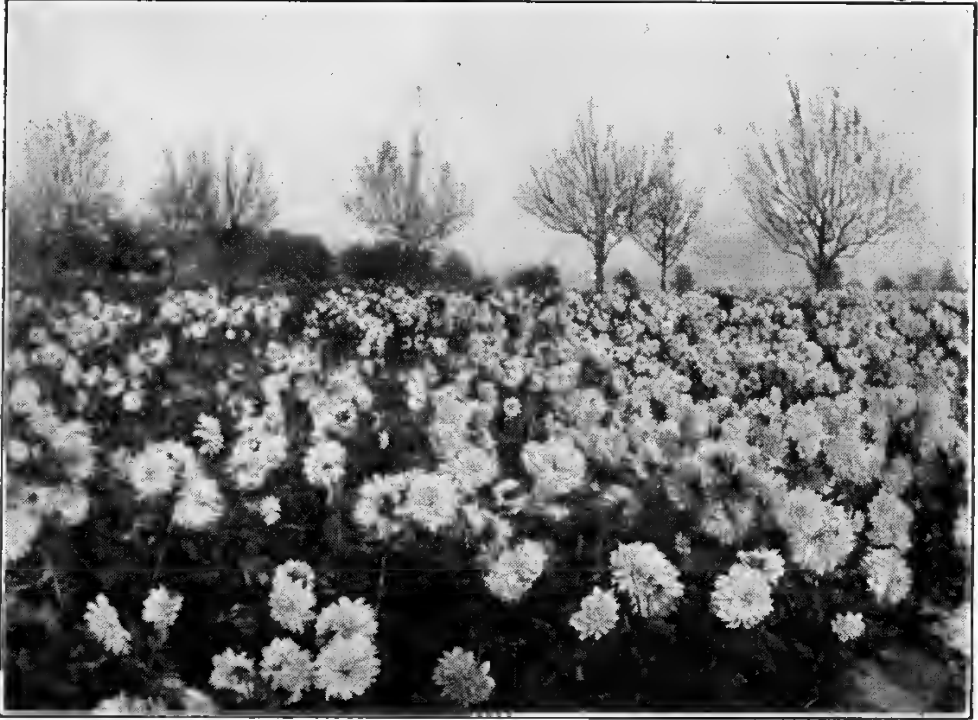
FIELD OF BREAK O' DAY