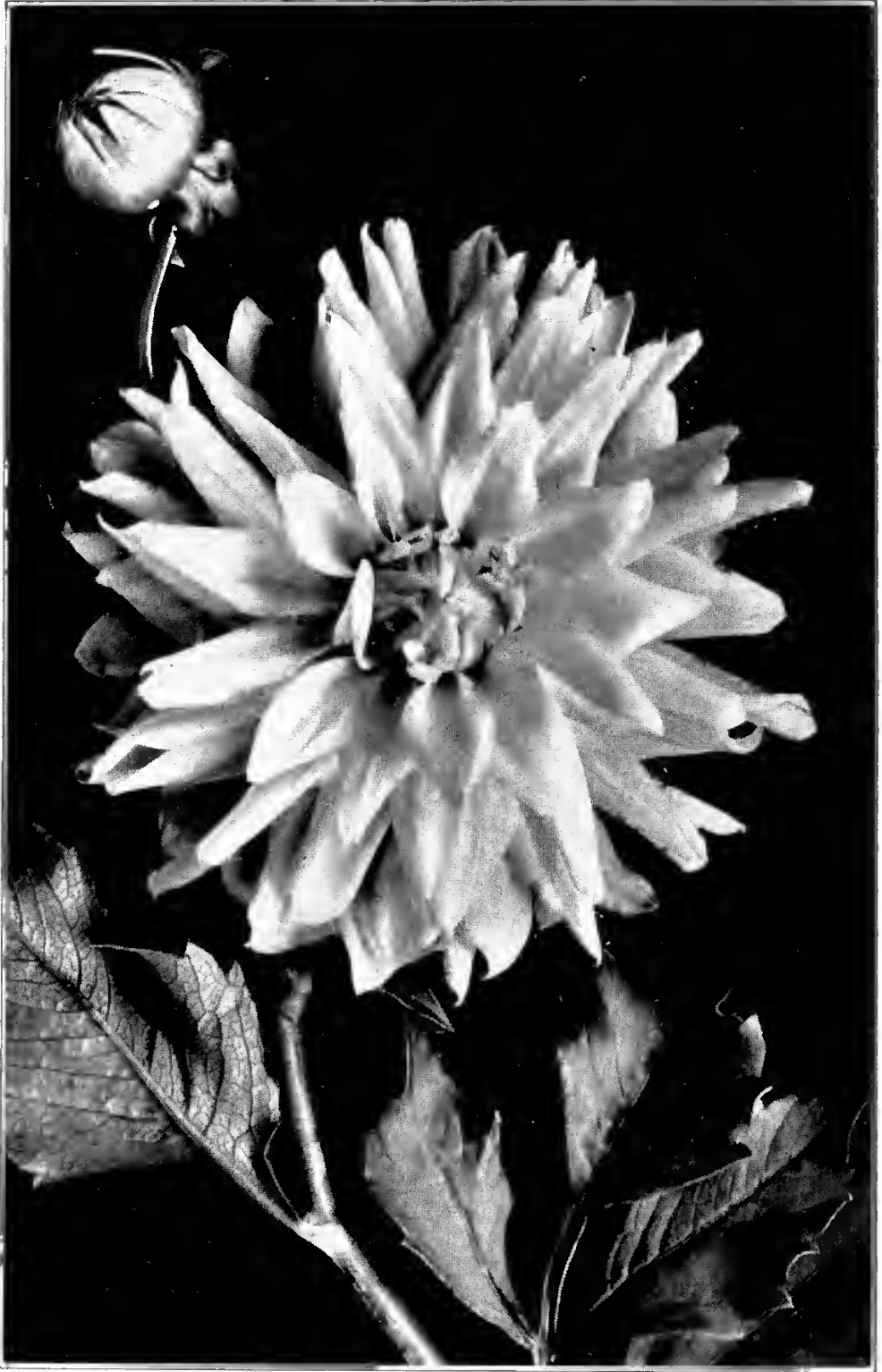
COLOSSAL PEACE (HYBRID-CACTUS)