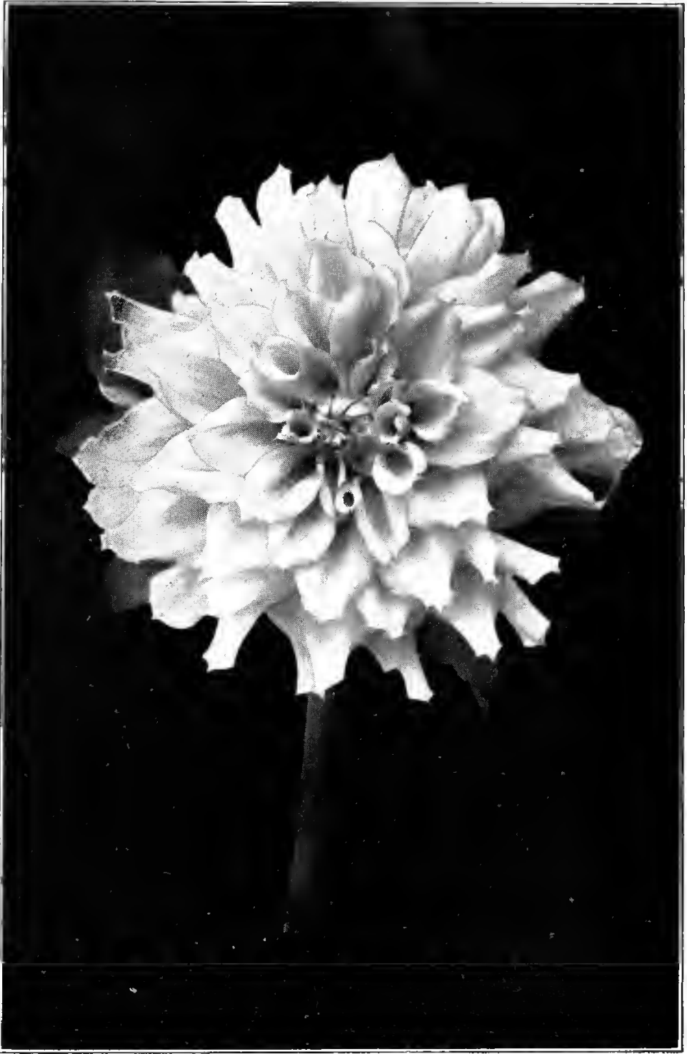
BREAK O' DAY