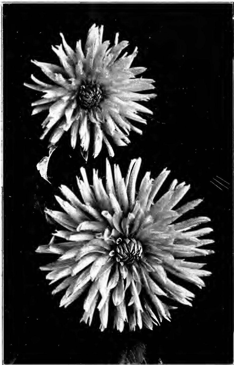
NIBELUNGENHORT (COLOSSAL CACTUS)