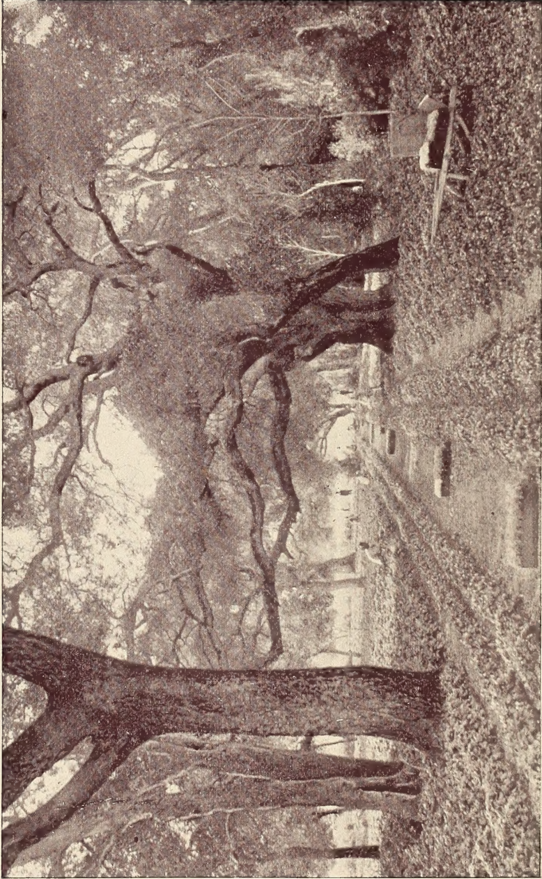
VIOLET BEDS, SHERWOOD HALL NURSERIES, MENLO PARK