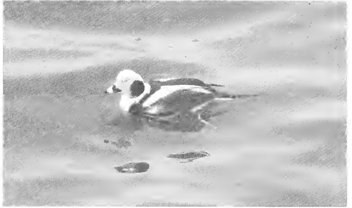
Drake Long-tailed Duck

Harbor Seals on islands three and four entertained as they porpoised, bobbed, and sunbathed, while a pair of Yellow-rumped Warblers proved that there really are few habitats that the little birds will not occupy.