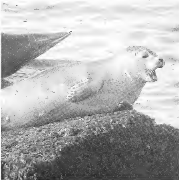
Harbor Seal on CBBT Island #4

Sadly, the information received was not entirely accurate, and this, combined with the number of people enjoying an unseasonably warm day at the shore, meant any Snowy Owls at Assateague Island were no doubt as far from the paved parking areas as possible. With not much daylight to spend, we regrettably left Assateague for a rendezvous with more sea ducks at