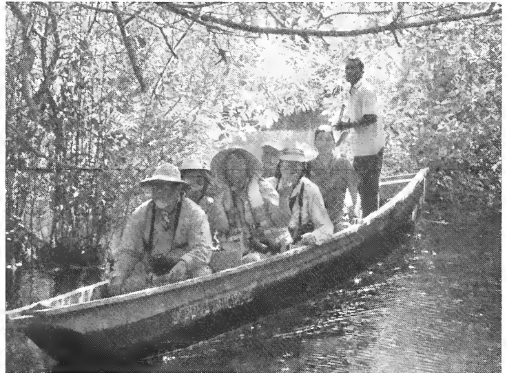
Birding... CBC style!

The Carolina Bird Club recently donated to the conservation organization Saving Species, whose main objective is to stop extinctions in the most biodiverse and threatened places in the world. Saving Species has funded conservation projects in Brazil, Madagascar, and Colombia. This collective of senior conservation scientists invests all its donations into the protection or restoration of important habitat for critical species by partnering with local organizations. The funds donated by the CBC will contribute to bird conservation in Colombia in places that generate the largest conservation benefit by protecting high concentrations of endemic and threatened birds. This donation was inspired by the success of a recent CBC bonus field trip to Colombia led by the authors. Colombia is home to more bird species than any other country in the world, but unfortunately many are at risk of extinction. The trip leaders and CBC executive committee agreed that a portion of any unspent trip funds should be set aside for bird habitat conservation in Colombia, and we felt that Saving Species would be an ideal recipient for such a donation due to their ongoing conservation efforts in Colombia. For more information on Savings Species, see http://savingspecies.org .