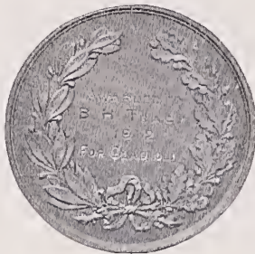
Gold Medal awarded at Varese, Italy

No orders for these mixtures taken for less than twenty-five bulbs. Twenty-five at the hundred rate; 250 at the thousand rate.