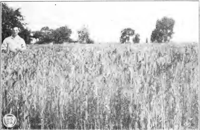
FIG. 3.—An increase field of Hard Federation wheat, C. I. No. 4733, showing erect, strong stems 45 inches tall, at Chico, Calif., in 1920.

Baart was introduced, under the name Early Baart, from Australia by the United States Department of Agriculture in 1900. It did not become an important commercial variety in California until 1919, when it was widely distributed. Early Baart is a tall slender-strawed bearded wheat with white chaff and straw and large semihard kernels. It is more susceptible to shattering than Pacific Bluestem. In common with other varieties it does not shatter so readily when winter or spring sown as when fall sown. At Chico Baart begins heading from 14 to 20 days earlier than Pacific Bluestem, depending on the date of seeding, and ripens from 4 to 8 days earlier. The difference in time of maturity decreases with the later sowings. The widespread distribution of this variety is due to its improved quality, its producing capacity, and its earliness, which makes it adapted to the drier lands.