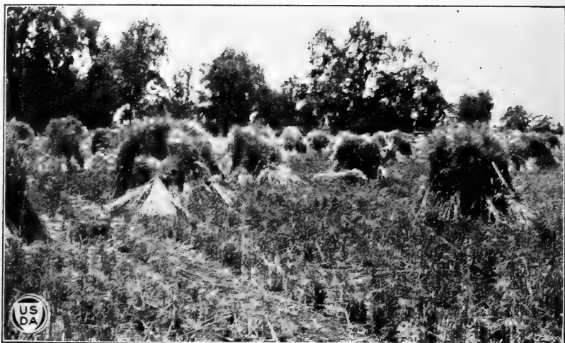
FIG. 2.—Wheat varieties in shock in the plat experiments at the Plant Introduction Station, Chico, Calif., in 1911.

In determining their adaptation the varieties have been grown in field plats so as to approach field conditions as nearly as possible. The plat unit at Chico has varied, but the size used has been uniform in each year. The measure of adaptability has been the yield of grain taken in connection with the qualities desired in the cereal in question. In addition to determining yield careful observations have been made during the periods of growth and ripening on the habit of growth, susceptibility to disease, etc. Although an effort is made to approach field conditions it is recognized that from such small units