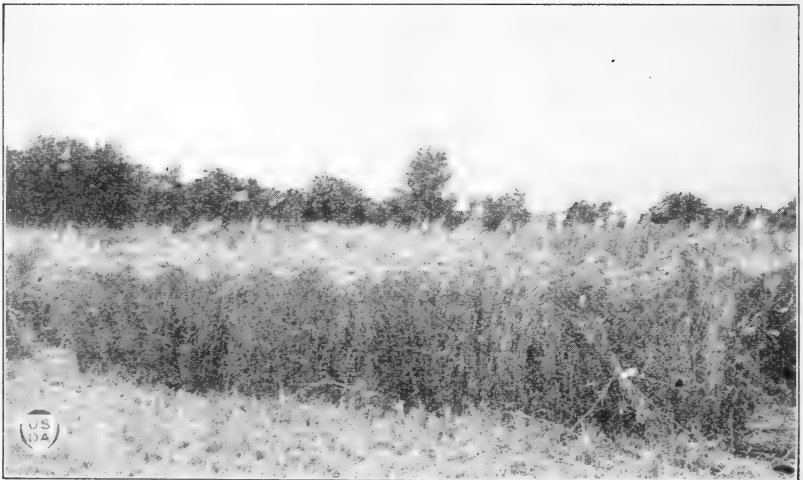
FIG. 4.—Some of the pure-line selections of barley growing in nursery rows at the Plant Introduction Station, Chico, Calif., in 1920.

Numerous barleys from various sources have been tested in the varietal nursery. (Figs. 4 and 5.) The agronomic notes include special notes on Rhynchosporium infection and types of shattering. Coast (C. I. No. 690) has consistently been one of the best varieties. A few promising varieties have been advanced to the plat experiments. Most barley varieties are not adapted to California conditions.