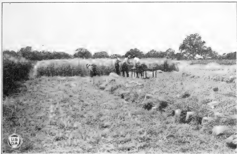
FIG. 5.—Harvesting the extensive barley nursery at the Plant Introduction Station, Chico, Calif., in 1920.

A dormancy experiment with barleys was conducted in 1920 and 1921. Eleven varieties of barley were sown at intervals of two weeks from autumn until late spring to determine after what date of sowing in spring a winter variety could not develop normally and produce heads in the same season. Notes on the first heading of all sowings