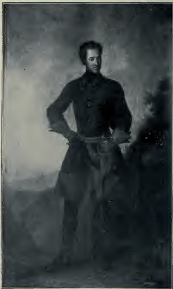
CHARLES XII., KING OF SWEDEN.

From a portrait in the Palace at Schwerin.