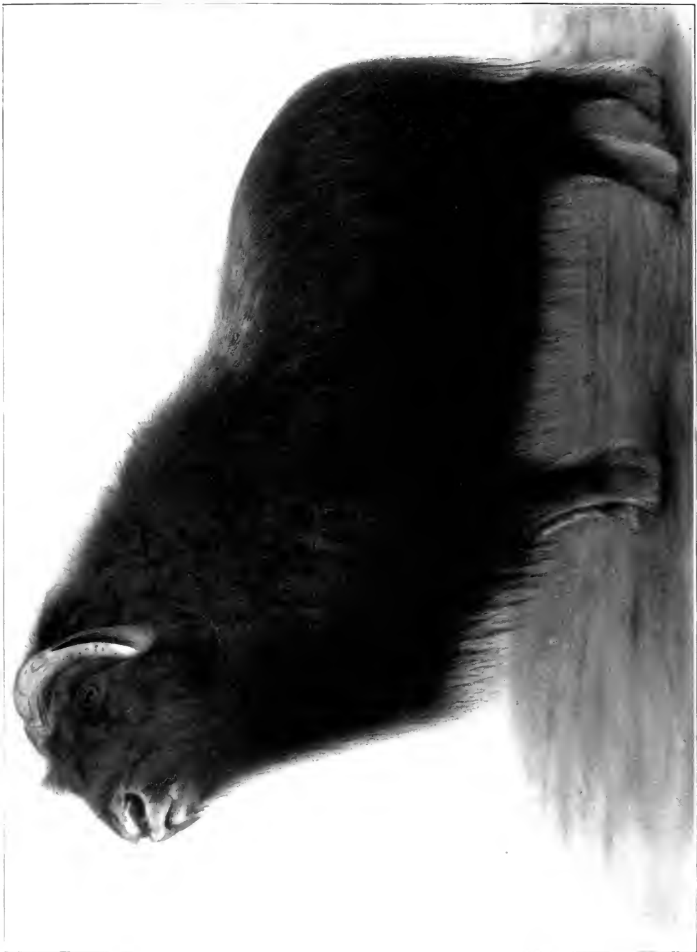
OVIBOS MOSCHATUS NIPHÆCUS ELLIOT. THE BLACK MUSK-OX.