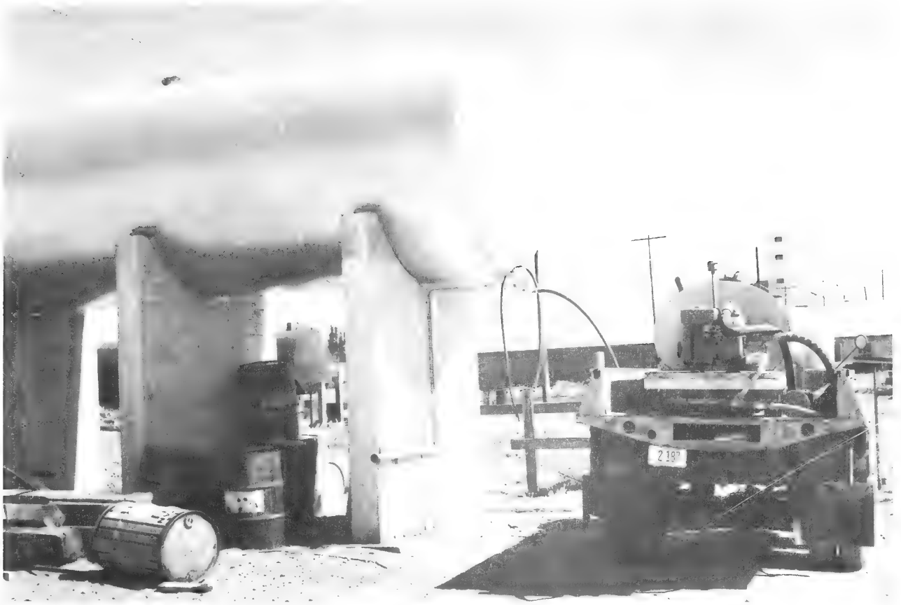
Figure 4.--Equipment for storage and application of grade B xylene or other aromatic solvents, consisting of 8,000-gallon storage tank, field tank, and 2-inch centrifugal pump; the latter two are skid-mounted.

Certain anionic-nonionic blend emulsifiers 6 at 1 to 1½ percent by volume of aromatic solvent provide excellent emulsions. As much as 2 percent emulsifier may be needed in small canals that are heavily infested with waterweeds. The emulsifier must be thoroughly mixed with the aromatic solvent before the solvent is applied. Mixing may be accomplished by agitating the solvent while the emulsifier is added. The importance of proper emulsifier, concentration, and thorough mixing for satisfactory control of submersed waterweeds cannot be overstressed.