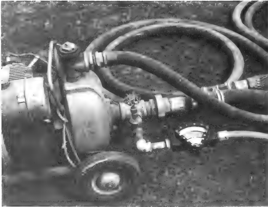
Figure 7.--Indicating flowmeters, simple in design and construction, made to specifications, and showing rate of flow in gallons per minute, have been more successful and trouble-free in applying aromatic solvents and other aquatic herbicides than register-type meters.