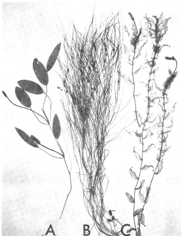
Figure 1.-- A , American Pondweed ( Potamogeton nodosus Poir); B , sago pondweed ( P. pectinatus L.); C , Richardson pondweed ( P. richardsonii (Ar. Benn.) Rydb.).

The most troublesome waterweeds in irrigation canals in the West are sago pondweed ( Potamogeton pectinatus L.), horned pondweed ( Zannichellia palustris L.), leafy pondweed ( P. foliosus Raf.), Richardson pondweed ( P. richardsonii (Ar. Benn.) Rydb.), American pondweed ( P. nodosus Poir.), American elodea ( Elodea canadensis Michx.), and several filamentous algae (Figures 1 and 2).