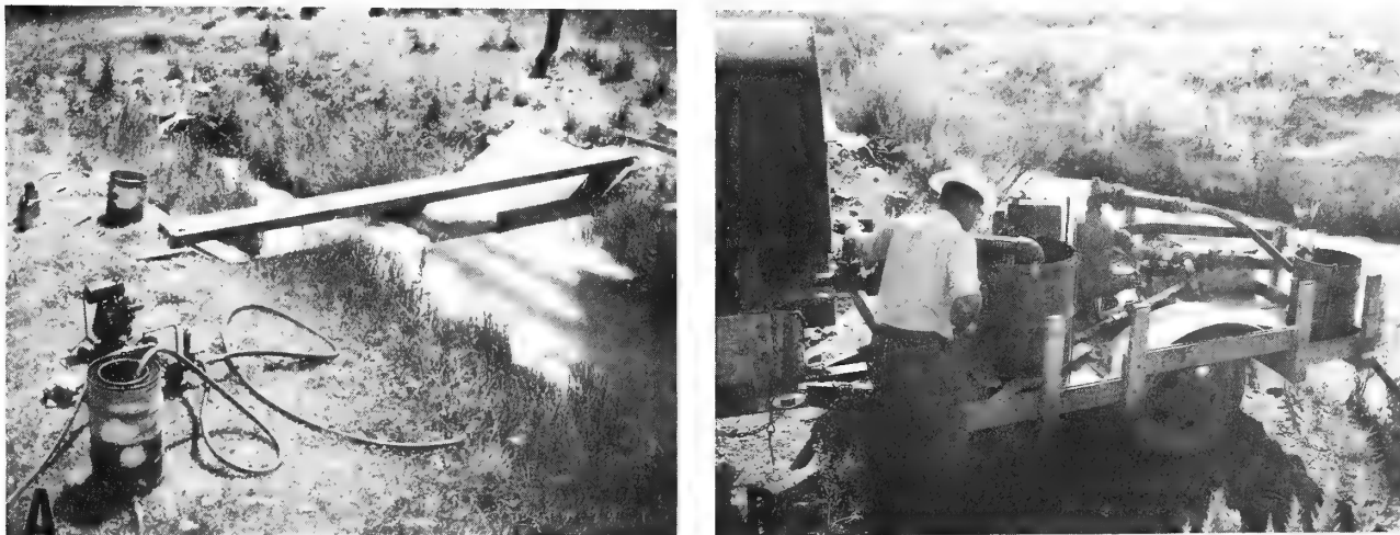
Figure 6.-- A , A simple unit for introducing aromatic solvent that consists mainly of a small gasoline engine, a \frac{1}{2} -inch gear pump, and a boom with fine spray nozzles. Note that the application is made just above a small drop. B , Water from the canal through a 4-inch hose and solvent from the supply tank via a calibration drum are drawn into the pump casing, and the mixture is discharged under pressure into the channel through a 2-inch hose with a fire-hose nozzle.

When the aromatic solvent is introduced into a channel by the direct method, application immediately above a weir, drop, or other structure with a moderately turbulent pool at the bottom helps to disperse the solvent. Applications with a high-volume centrifugal pump are not so dependent on water turbulence to establish a good emulsion. Other advantages of the indirect application method are: (1) clogging of small-orifice nozzles by foreign particles is eliminated, (2) positive mixing of water and solvent within the pump provides increased emulsion stability, and (3) channels with a wide range in capacities can be treated at the desired rate by simply adjusting the flow of solvent to the pump.