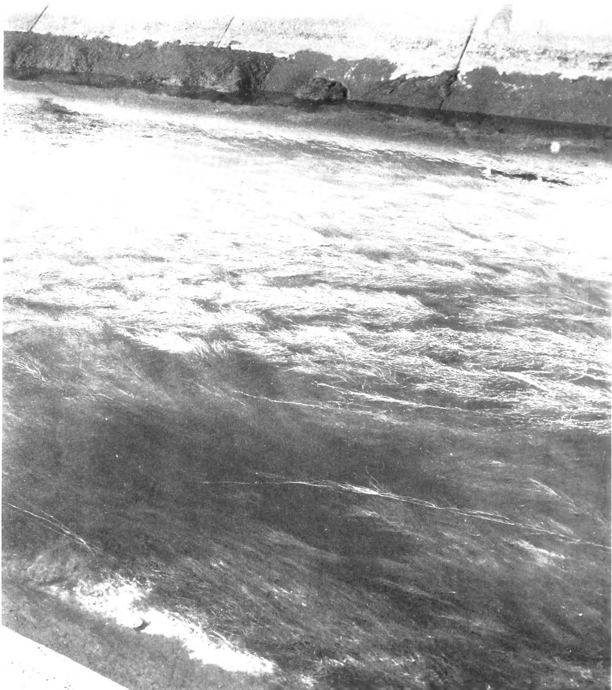
Figure 3.--A dense stand of waterweeds, primarily sago pondweed, growing in a section of lined canal on the Gila Project in Nevada. Deposition of sand and silt on top of the lining provided an ideal seedbed and anchorage for the waterweeds.

Curlyleaf pondweed ( P. crispus L.), water stargrass ( Heteranthera dubia (Jacq.) MacM.), and waterplantain ( Alisma gramineum (Torr.) Sam. var. Geyeri ) are problem weeds in canals in some areas. Most of these waterweeds are rooted in the soil at the bottom and sides of irrigation channels and grow almost entirely beneath the water surface (Fig. 3). They are commonly referred to as moss or horsetail moss.