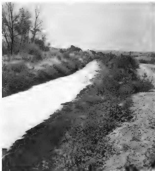
Figure 5.--Matted waterweed growth prevents the proper distribution of an aromatic solvent emulsion.

The aromatic solvent should be applied as soon as waterweeds begin to interfere noticeably with normal delivery of water and before plants reach the water surface. Excellent temporary control is obtained when treatments are applied at an earlier growth stage, but regrowth is rapid and retreatments are required within a short time. Treatments applied after the plants have matted at the water surface are usually less effective because the compacted weed growth forces the main current to pass over or channel around the mats of waterweeds and prevents proper distribution of the emulsion (Fig. 5).