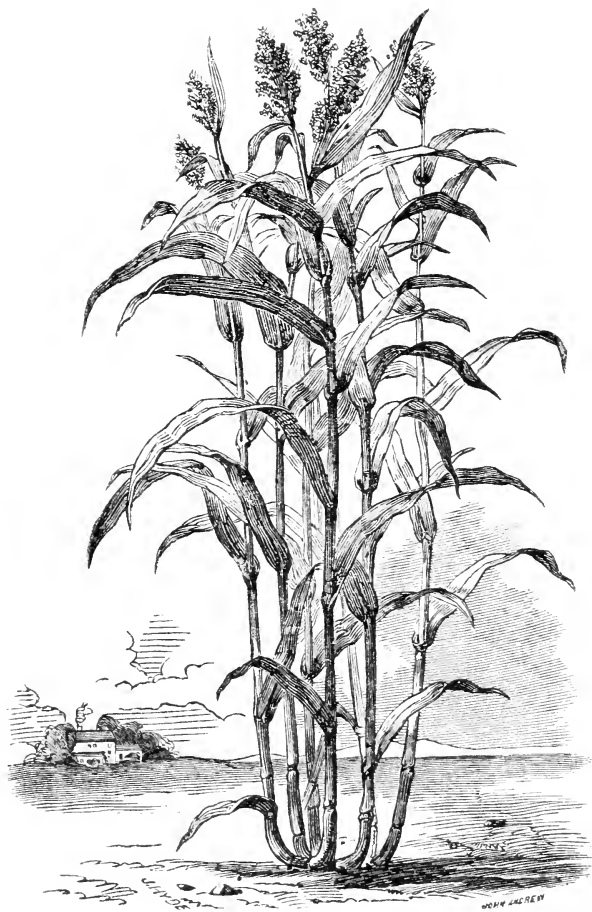
THE CHINESE SUGAR-CANE.