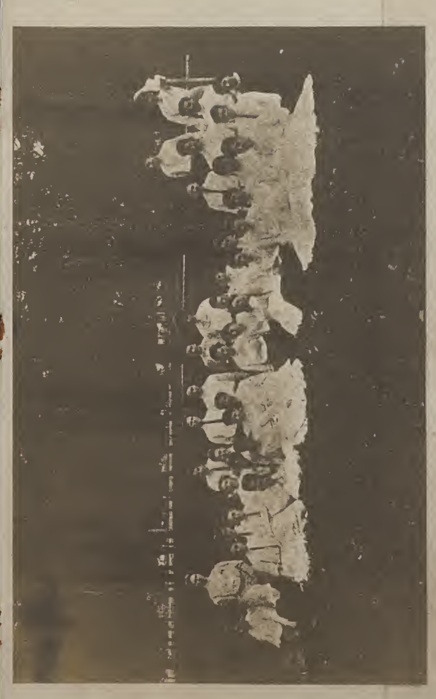
P. N. A. BOCIETY.