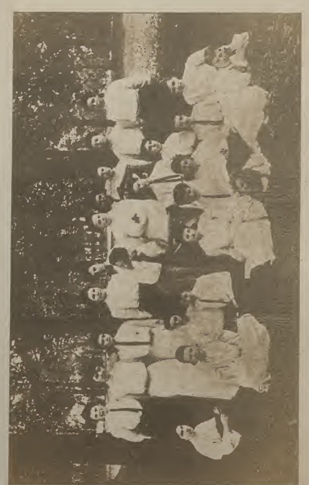
O. V. A. SOCIETY.