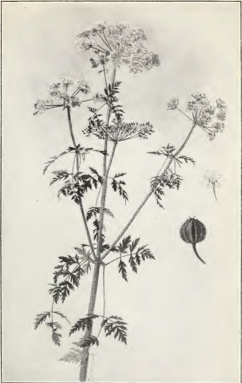
CONIUM MACULATUM, SHOWING LEAVES, FLOWERS, AND FRUITS.