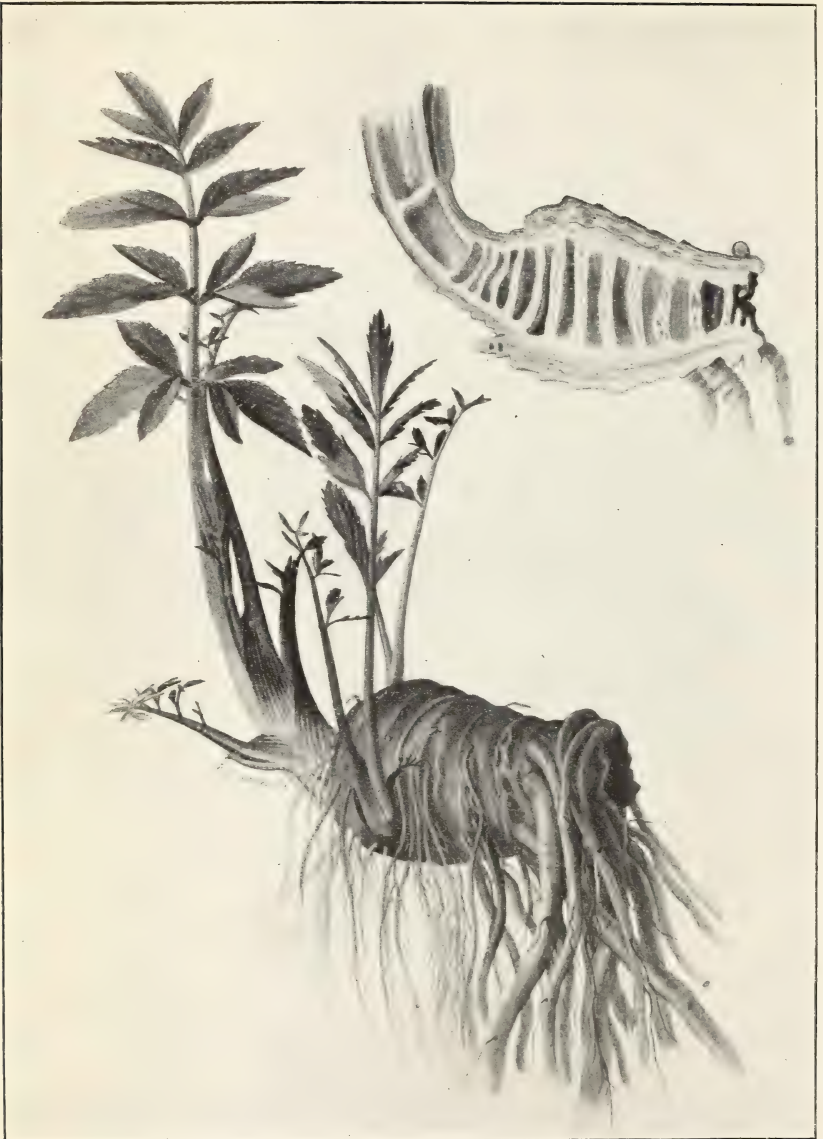
A YOUNG PLANT OF CICUTA VAGANS , SHOWING THE FORM OF THE ROOTSTOCK.