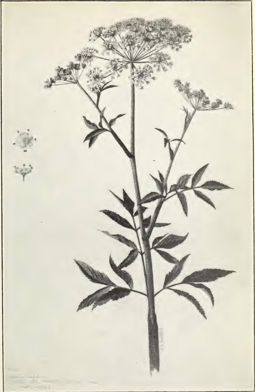
CICUTA VAGANS, SHOWING LEAVES AND FLOWERS.