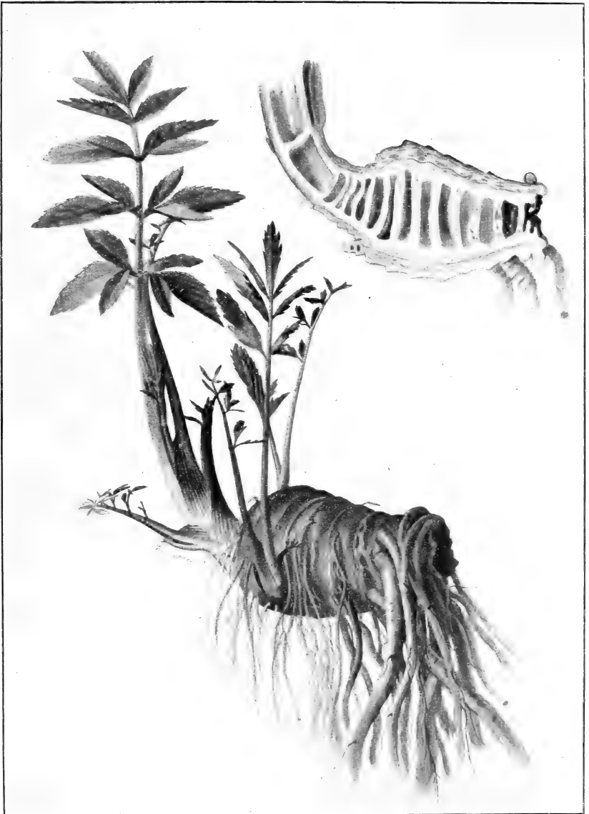
A YOUNG PLANT OF CICUTA VAGANS , SHOWING THE FORM OF THE ROOTSTOCK.