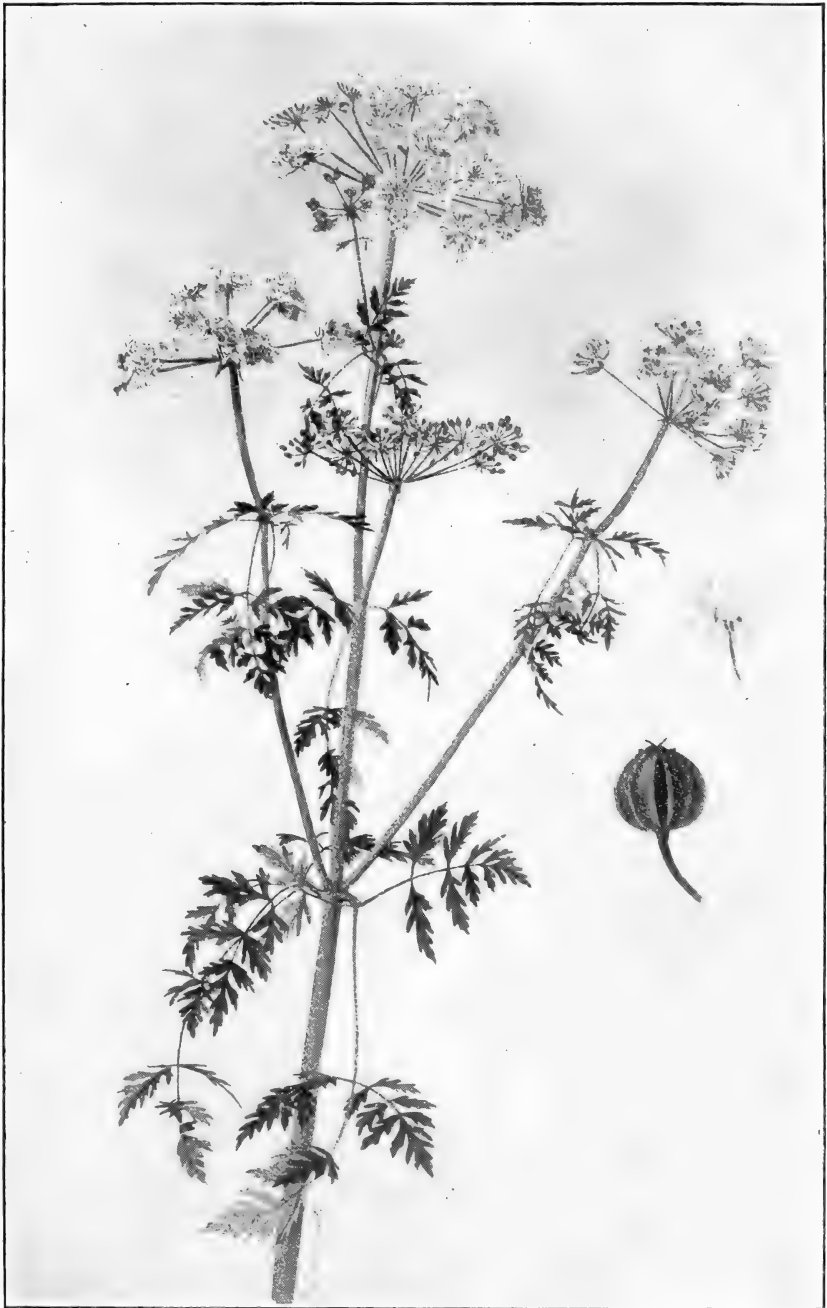
CONIUM MACULATUM, SHOWING LEAVES, FLOWERS, AND FRUITS.