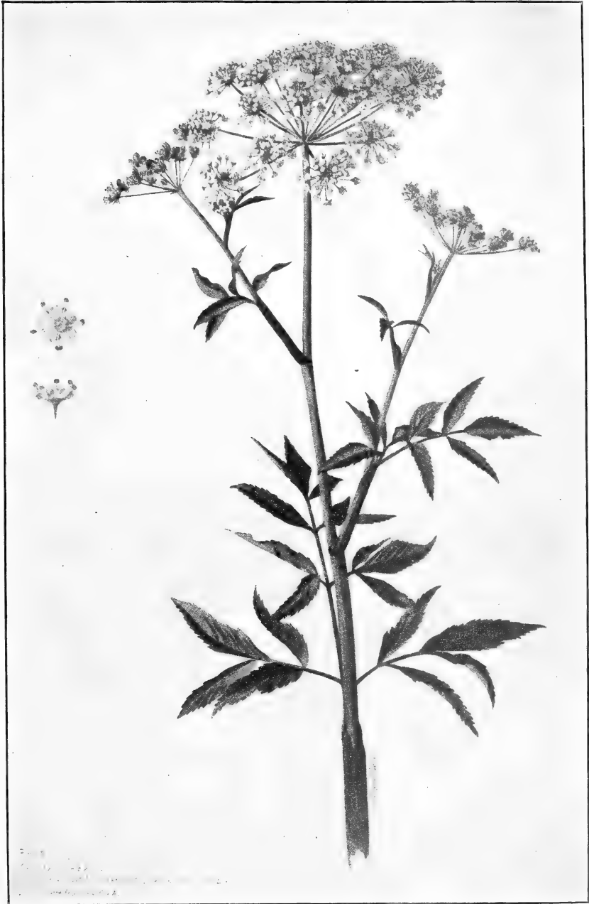
CICUTA VAGANS, SHOWING LEAVES AND FLOWERS.