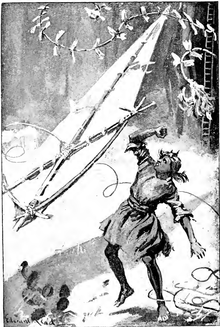
SPRANG NIMBLY TO ONE SIDE.