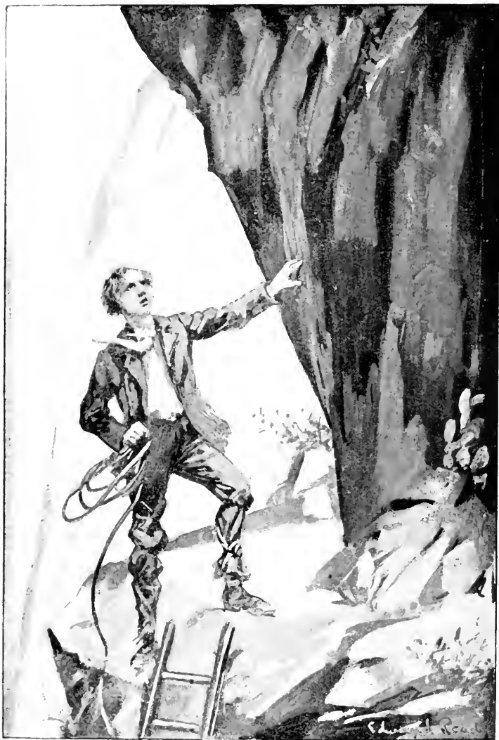
AGAINST THAT ROCK NO LADDER COULD BE SET.