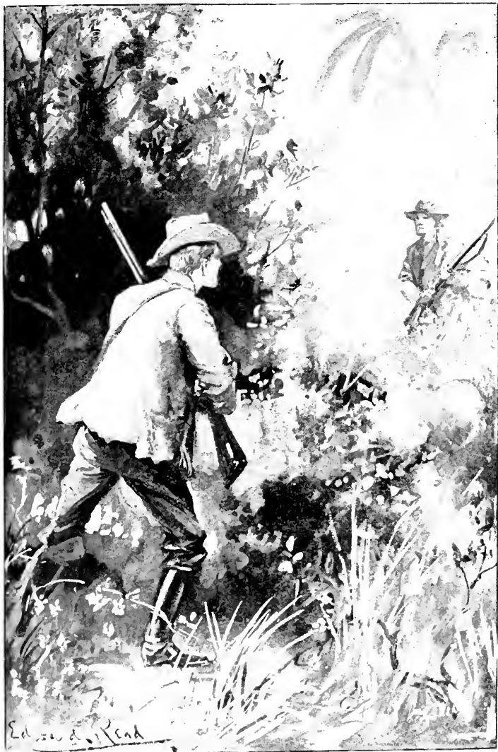
BOTH WITH COCKED GUNS IN THEIR HANDS STOOD EYEING EACH OTHER.