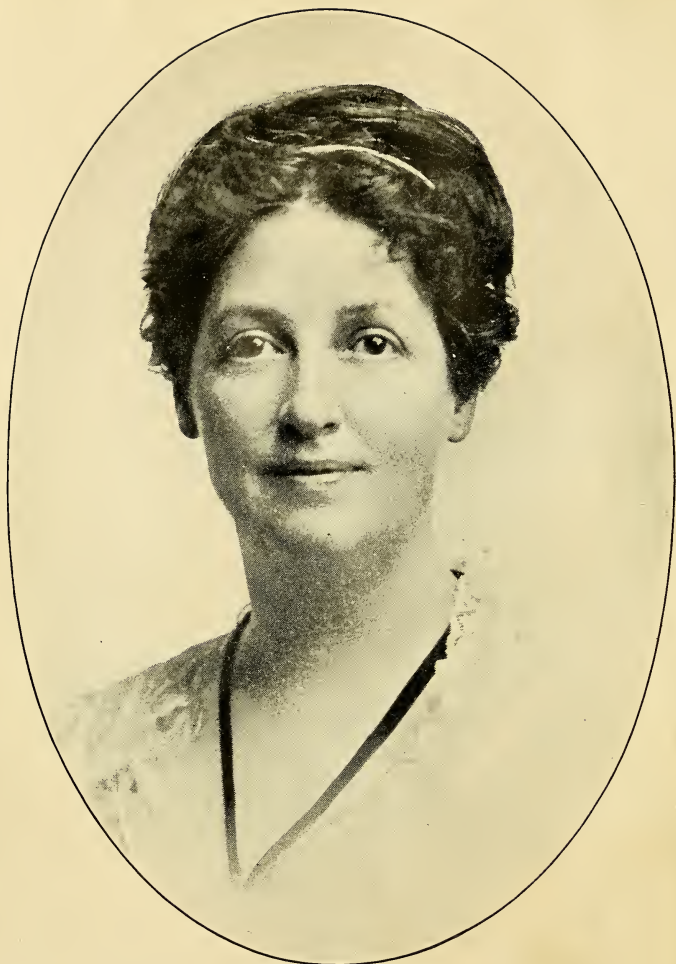
Josephine Preston Peabody.