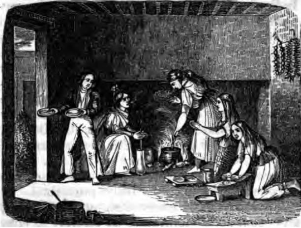
A KITCHEN SCENE.

comal ( comalli , by the Indians), and placed over the fire, where, in less than three minutes, it is baked and ready for use. The thinness of the tortilla is always a great test of skill in the maker, and much rivalry ensues in the art of preparation. The office of making tortillas has, from the earliest times, pertained chiefly to the women, who appear to be better adapted to this employ than the other sex, both as regards skill and dexterity, in preparing this particular food for the table. I perfectly agree with the historian Clavigero, however, in the opinion that "although this species of corn-bread may be very wholesome and substantial, and well-flavored when newly made, it is unpleasant when cold."