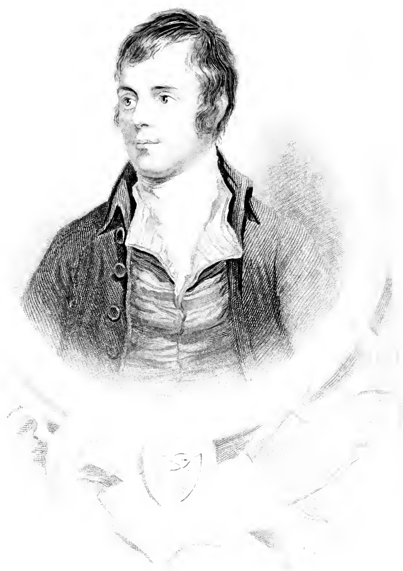
Robert Burns - 87ct.