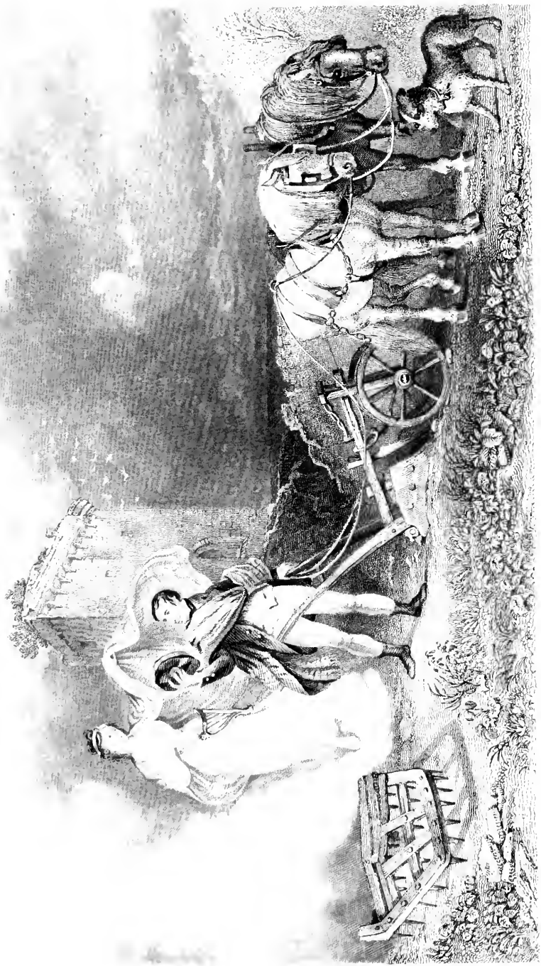
The man and his dog, and the horse and cart, at the point, and throw her, insipidly, over the