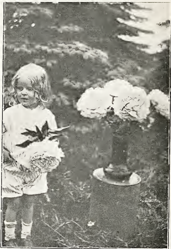
Dorothy and LaFrance Peonies