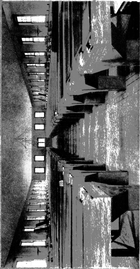
INTERIOR OF ONE OF THE HATCHING BUILDINGS AT STATE HATCHERY, SISSON, CAL.