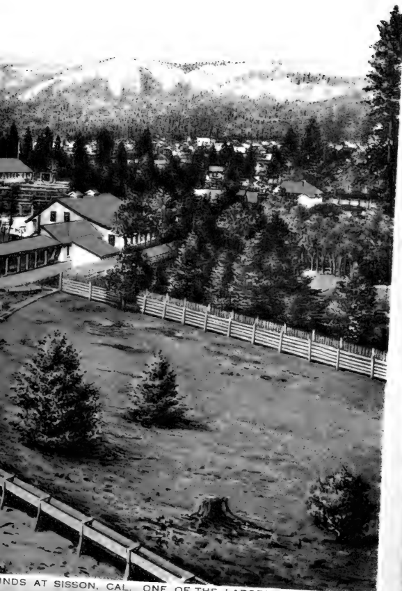
RANCHES AT SISSON, CAL. ONE OF THE LARGEST AND MOST BEAUTIFUL IN THE MOUNTAIN WEST.